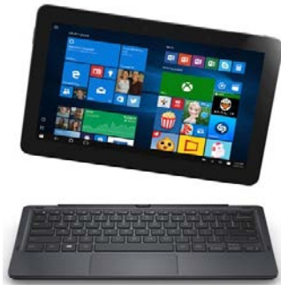
Dell Latitude 11 5179