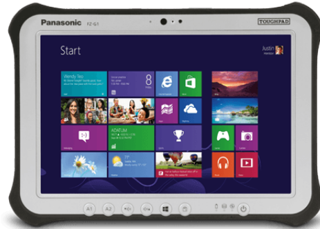
Panasonic Toughpad FZ-G1

Recreation Tab, now broken out. – If you have uploaded the App recently, you might have noticed a few new buttons. With so much information being housed on the Recreation Tab, it was making it really difficult to find anything. So we broke the information out into 2 new sections related to the Recreation Tab “Forms”, and “Parks & PSA’s”. Forms will now house our common and lake specific forms, both fillable and non-fillable, to both distribute to the public and to be utilized by Park Rangers in the field. The other section Parks & PSA’s now feature a listing of all your PSA’s on OMBIL. This listing is broken down into two separate sections for Corps Managed and Non Corps Managed. Each PSA on OMBIL will have listed the Address, Phone, GPS Coordinates, & Related Website. There are also hot buttons at the bottom of each PSA that can be used to check site availability on NRRS, a data sheet for public use, a QR code for quick scan turn by turn directions to that PSA, and related park maps and utilities. All this information is not on OMBIL, especially for your Non-Corps Managed parks so we need your help in rounding up this information to be plugged in. Just go to the app for your lake and see what is missing and either fill it in yourself or send me an email with the info. See screen shots below for reference.