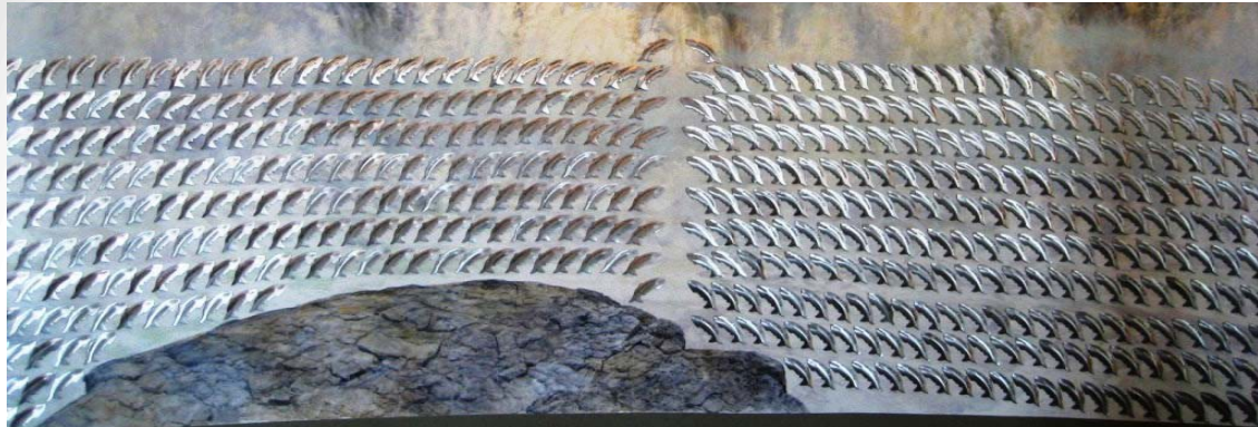
Donor board at the Tillamook Cultural Institute, Tillamook, Oregon

For contributions valued at $XX (TBD by manager) or above, a donor board or wall located and integrated into the project office, visitor center, or other appropriate visitor facility may be used to recognize the donation.