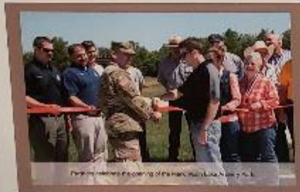
Partners and staff at the Mark Twain Lake, Mo.