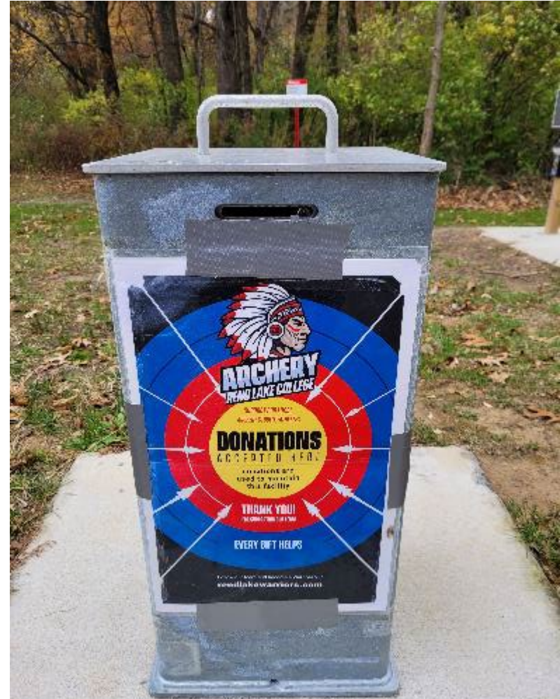
Mark Twain Lake FOREST Council and Rend Lake College Contribution boxes at recreation areas and visitor center