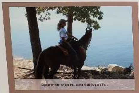
Guests enjoy riding the Joanna Trail Project.

Each year, the U.S. Army Corps of Engineers partners with thousands of individuals and organizations on recreation and environmental projects to enhance our nation's natural resources. At Mark Twain Lake, we are proud of our broad range of partners and eagerly seek to expand mutually beneficial relationships with others.