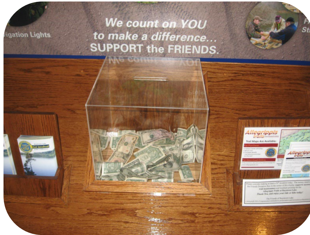
Raystown Visitor Center