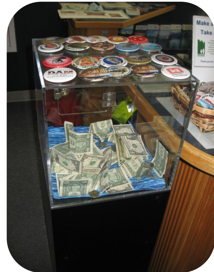
Bonneville Visitor Center