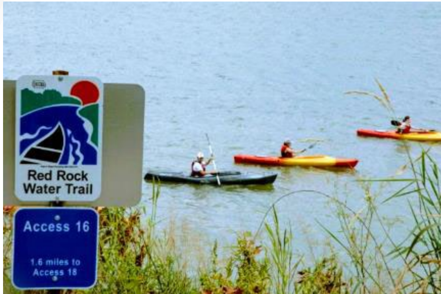
Lake Red Rock on the Des Moines River