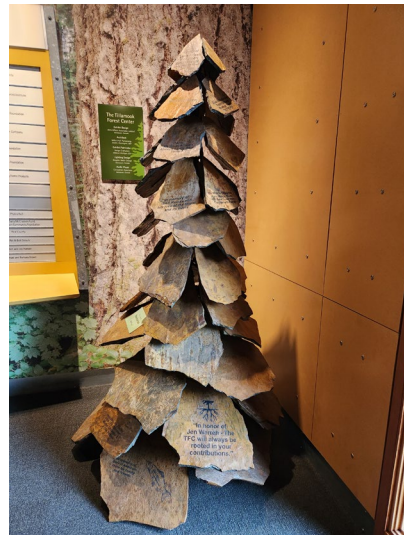
Donor wall and tree at the Tillamook Forest Center, Oregon