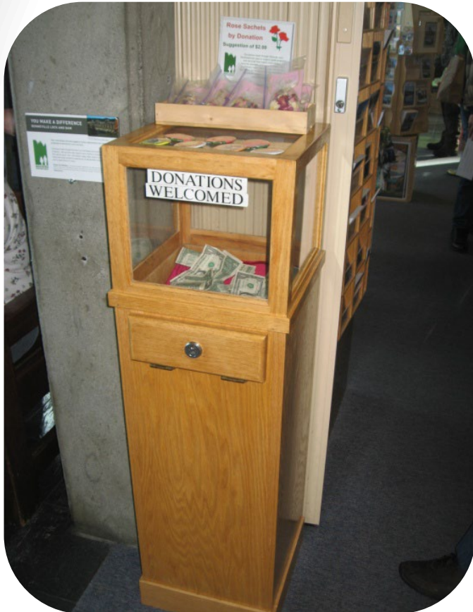
Bonneville Visitor Center