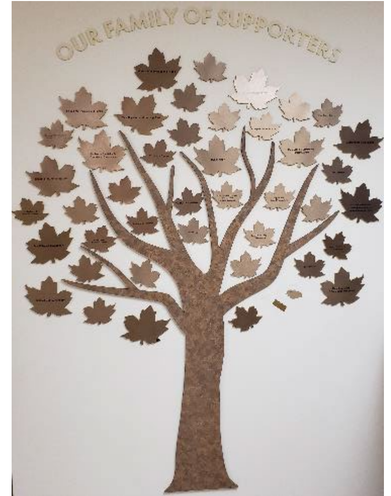
Donor tree at W Kerr Scott