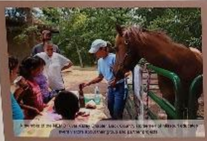
A view of the NEMO River Valley Chapter, Back Country Horseman of Missouri, at the Mark Twain Lake.