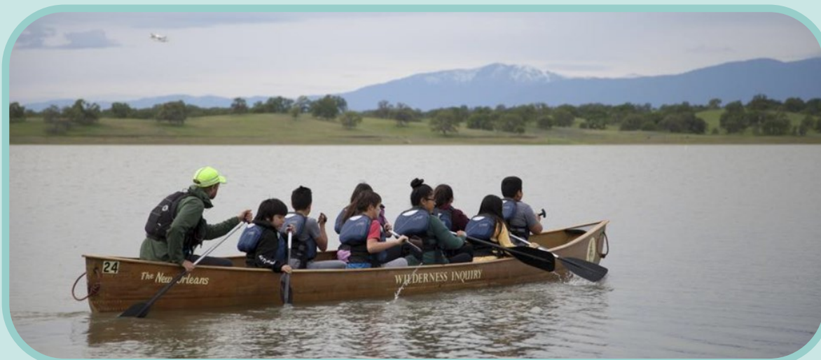
USACE park rangers and Wilderness Inquiry volunteers teamed up at Black Butte Lake, California on April 11, 2019 to educate and train nearly 400 students from local elementary schools. Students learned how to safely navigate waterways in canoes and save others from drowning. The youngsters also learned important lessons about natural resources and the culture and history of the lake.