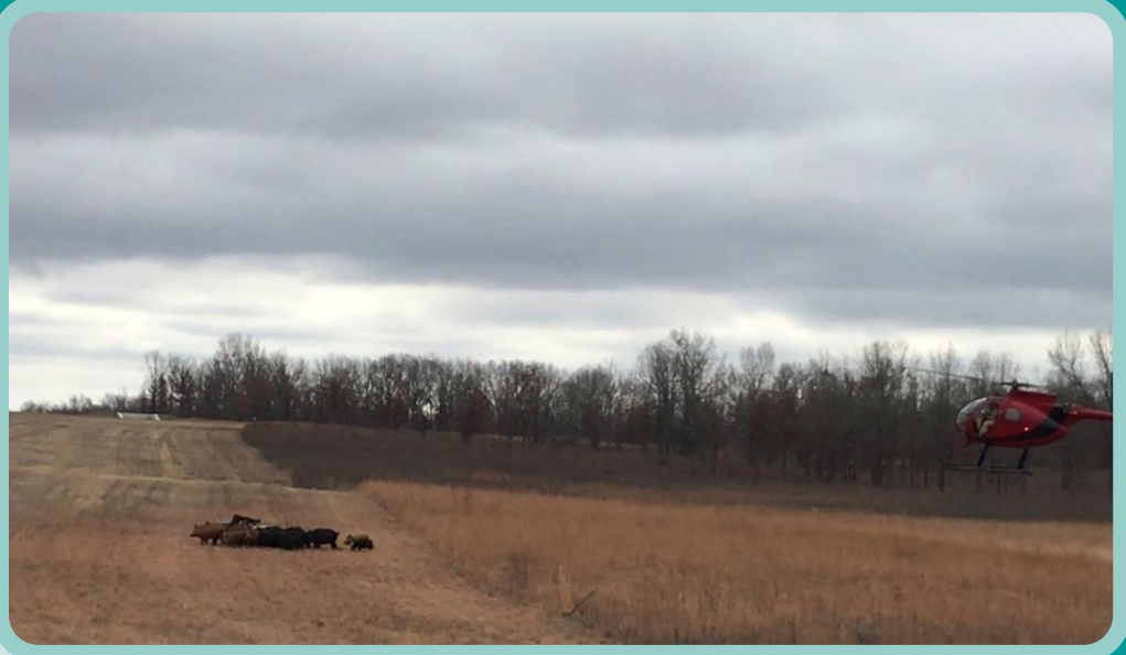
USDA helicopter in action over a sounder of feral swine

Whether ground-trapping or aerial elimination, experts with WS have found that eradication of whole sounders (groups of hogs led by the adult females) is the most effective method of feral swine control. Removal of a few hogs or separating groups only disperses the groups and creates multiple sounders from the original. Employing proven strategies, WS and their partners,