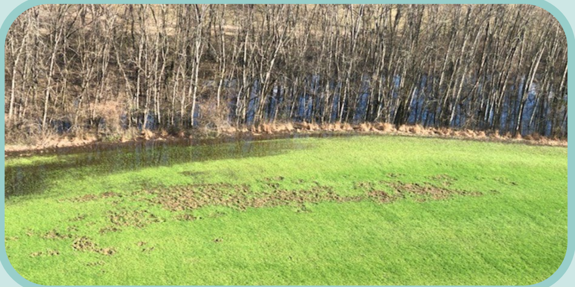
Feral swine rooting damage in an agricultural field near Cordell Hull Lake in Jackson County, Tennessee

Traditional swine hunting is ineffective for controlling or eliminating hog populations. In fact, legalizing hunting has exacerbated the problem by increasing the incentive to illegally stock feral swine into new areas. This undermines agencies' efforts to control or eliminate the hogs. Because of this, in 2011, the Tennessee Wildlife