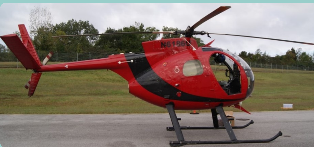
One of the USDA-owned helicopters used for feral swine control in Tennessee

Officials with WS report that 2,678 feral hogs were successfully removed from Tennessee’s landscape in fiscal year (FY) 2019 (3,209 in FY 2018). Since the beginning of FY 2020, when WS began to focus on the removal of the upstart hog population in Jackson County, with a particular focus on the swine population around Cordell Hull Lake, there have already been 77 hogs eliminated county-wide and 27 removed from USACE property (2,674 state-wide).