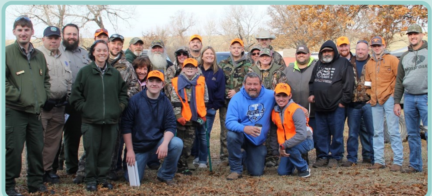
Staff from the USACE Lewisville Lake Project Office partnered with representatives from three local National Wild Turkey Federation chapters and Texas Parks and Wildlife Department to host a special deer hunt for five physically challenged youth.

Since the start of the event in 2018, TPWD and NWTf have communicated well with USACE. They take pride in