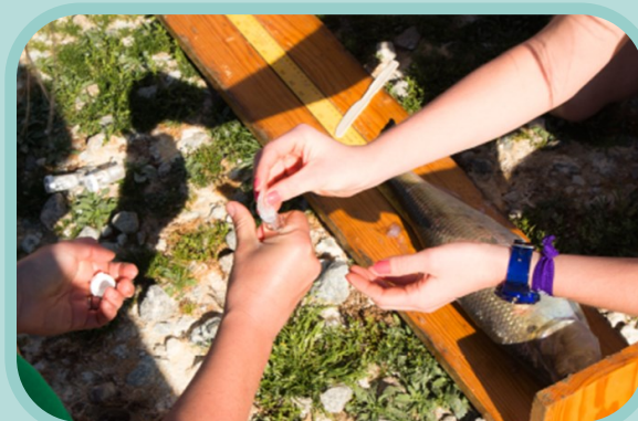
Biology students from Timberland High School collecting length and scale samples from the 2019 Fishing Day.