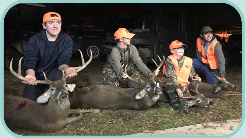
Youth hunters participating in the Wheelin' Jakes Youth Deer Hunt at Lewisville Lake show off their harvest at deer camp this past fall.

The partnership goes back prior to the hunt. USACE, NWTf, and TPWD have been partnering together to improve hunter access points at Ray Roberts Lake, which is managed by the Lewisville Lake Office, as well as