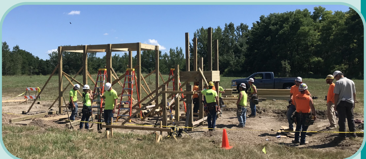
Volunteers work to construct an elevated shooting station at Saylorville Lake's archery range located in the Bob Shetler Recreation Area.