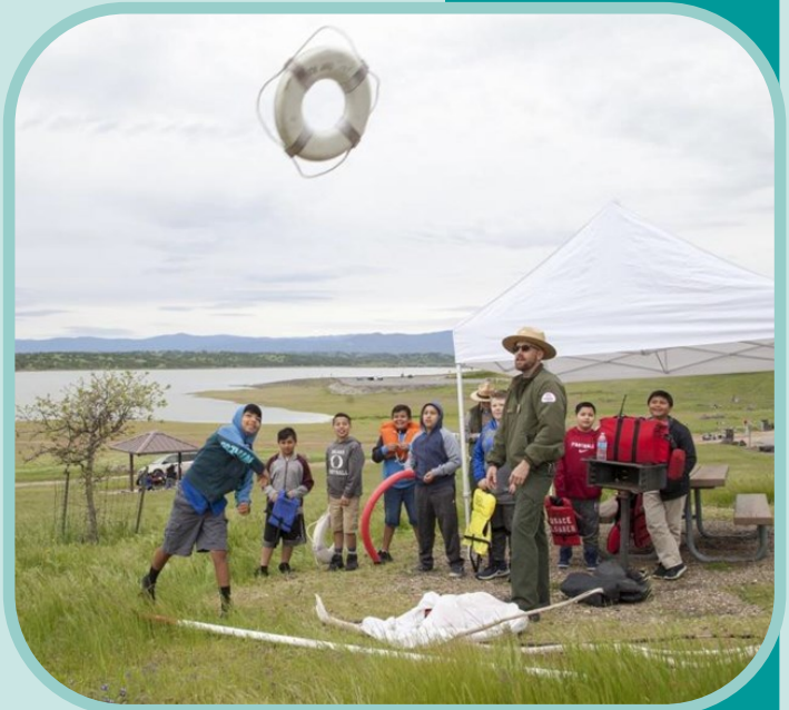
Students practice their skills at throwing a life ring

Canoemobile is a "floating classroom" that brings students out on local waterways in