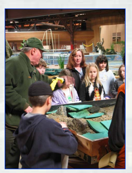
San Francisco Bay Model