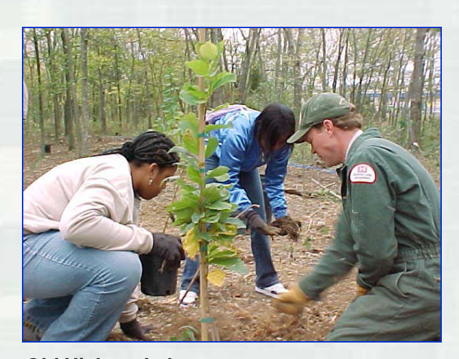
Old Hickory Lake