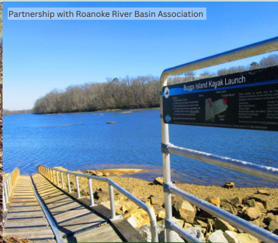
Partnership with Roanoke River Basin Association