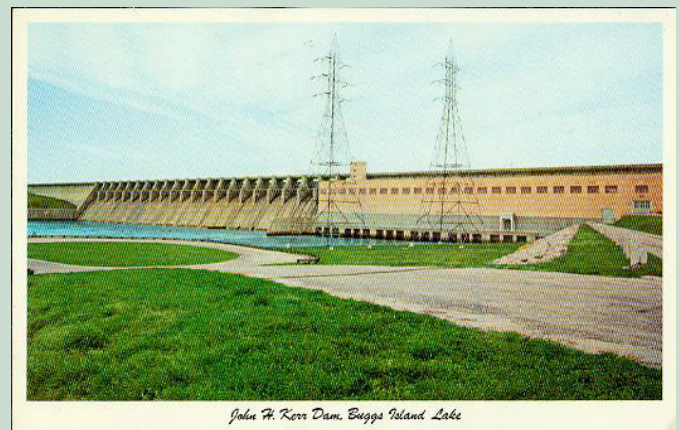
John H. Kerr Dam, Buggs Island Lake

Old postcard image taken from downstream side of Kerr Dam.