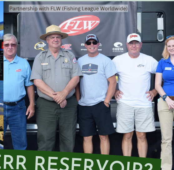
Partnership with FLW (Fishing League Worldwide)