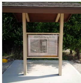
Finished Information Kiosk