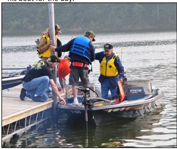
All ages had fun at this event!