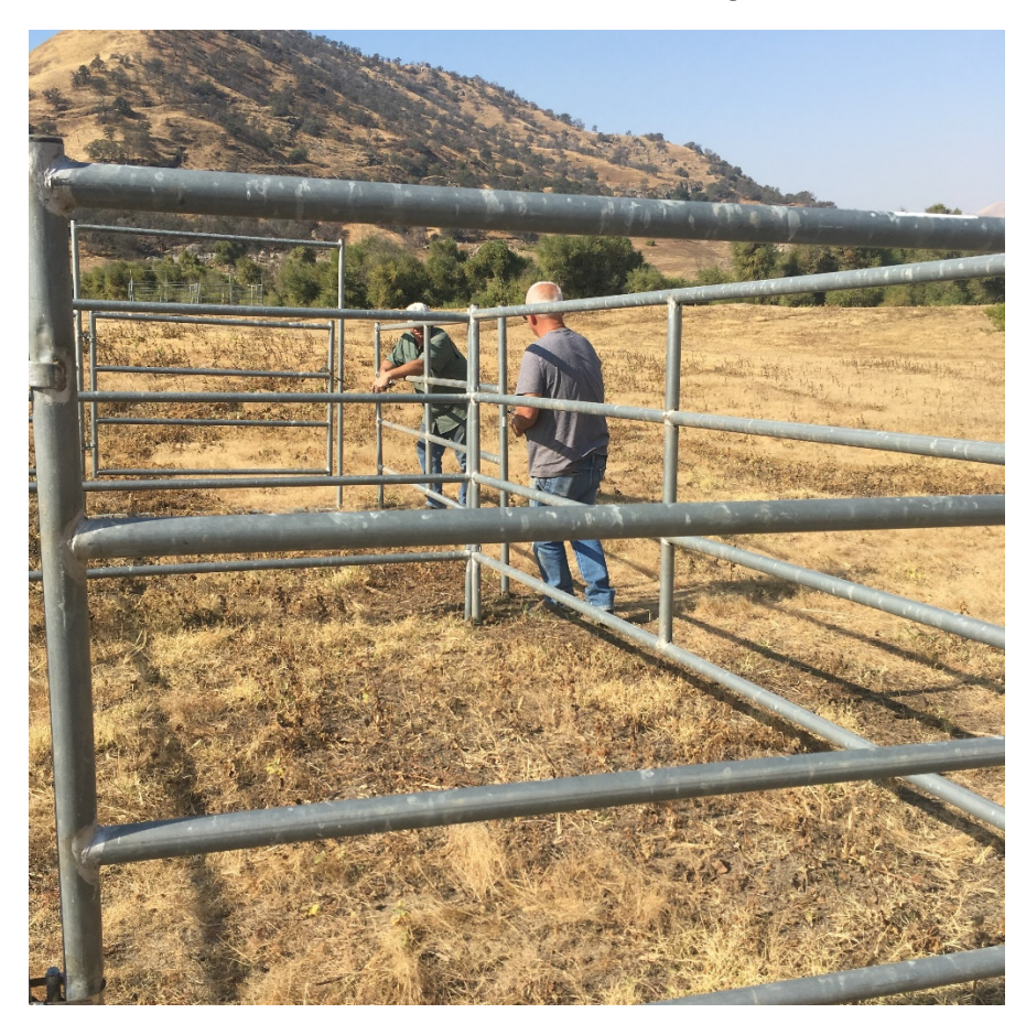
2018 Corral installation for fall /winter camping riding season.