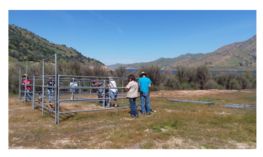
March 25, 2019, Corral removal before high water.