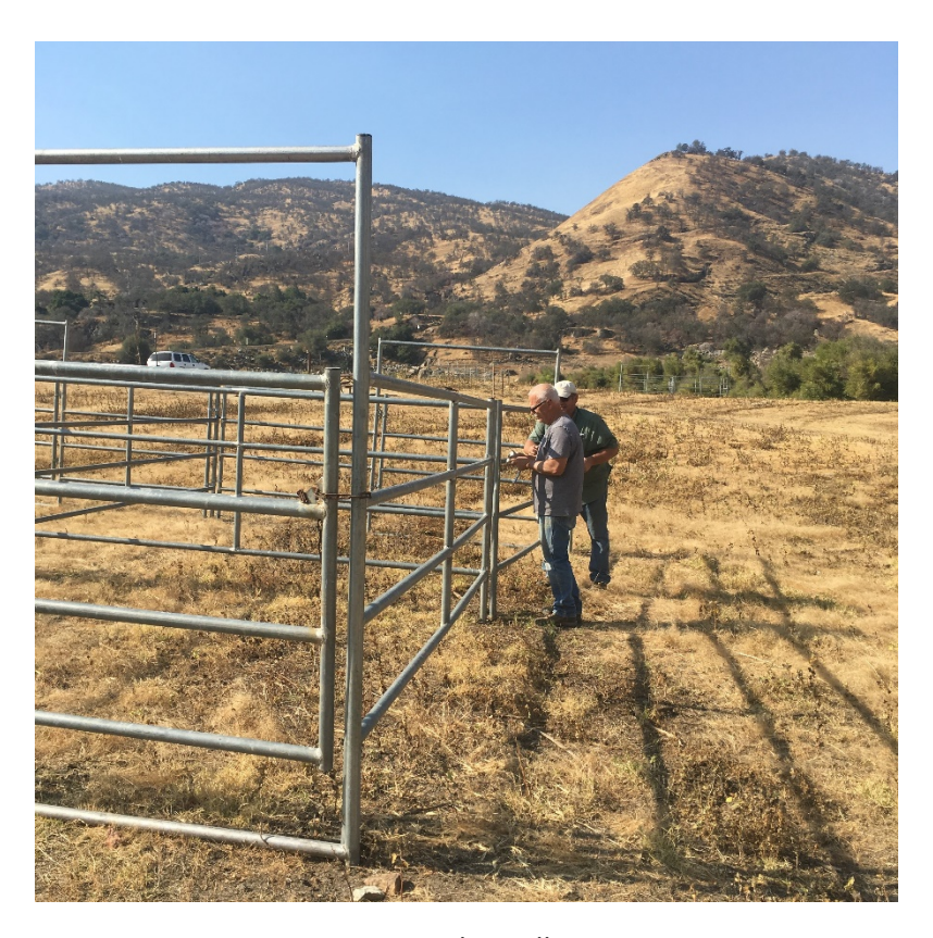
2018 Corral installation