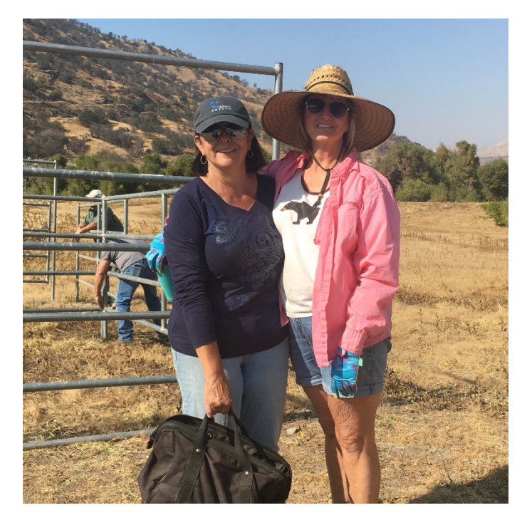
2018 -Two of the BCHC High Sierra Officers, past and present.