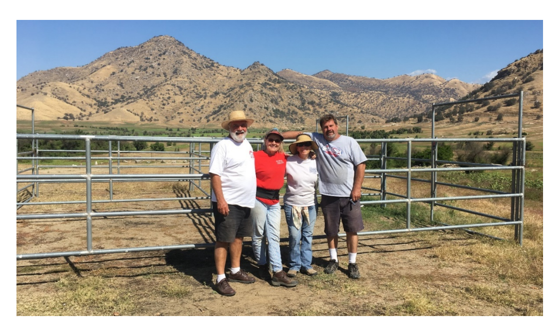
Part of the 2017 installation crew.