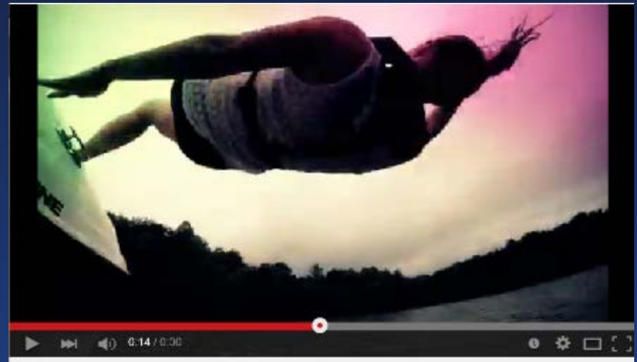
https://www.youtube.com/watch?v=45oDHvqOs24&feature=youtu.be Girl Overboard