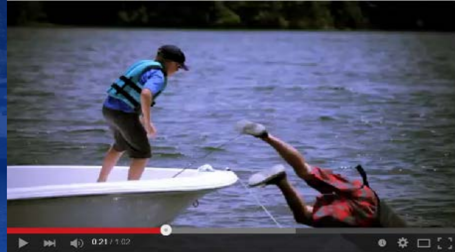
https://www.youtube.com/watch?v=hlZgSPiCkIc Man Overboard