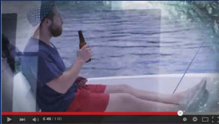
https://www.youtube.com/watch?v=9mr2ojcg-Sg&feature=youtu.be Drowning in 60 Seconds