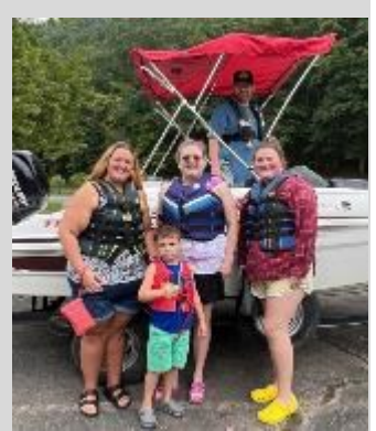
East Lynn Lake