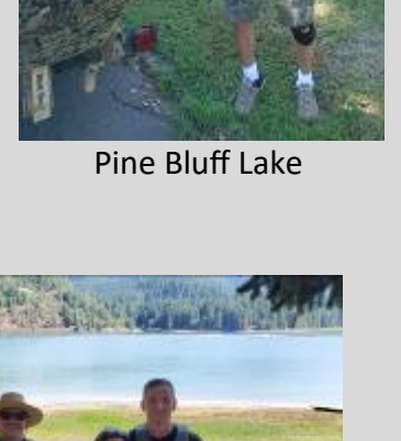
Willamette Valley Project