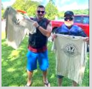
Caesar Creek Lake