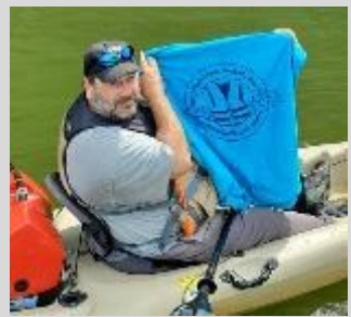
Crooked Creek Lake