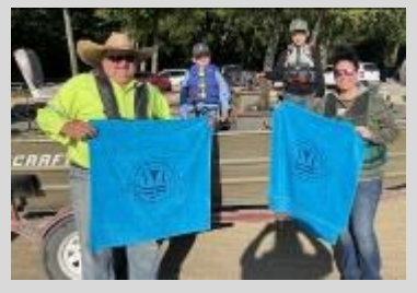
Mississippi River Project