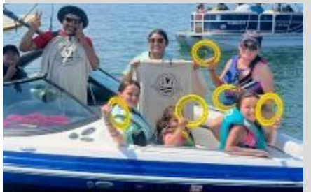
Greers Ferry Lake