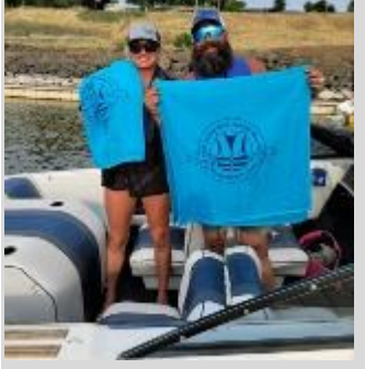
Lower Granite Project