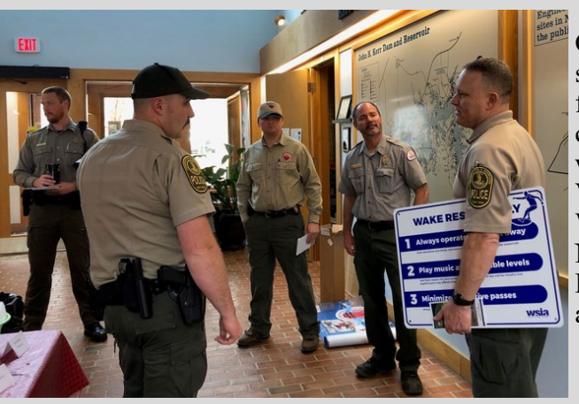
John H. Kerr Lake

On March 2, 2023 the John H. Kerr Lake staff hosted a safety meeting between partners and lease holders, which focused on water safety, sharing roles, responsibilities, and challenges in order to improve our communication and working relationships. The meeting was attended by Virginia Department of Wildlife Resources, North Carolina Wildlife Resources Commission, Virginia State Parks, North Carolina State Parks, Virginia Department of Forestry, Mecklenburg County Virginia Sheriff's Office, and USACE John H. Kerr Lake staff.