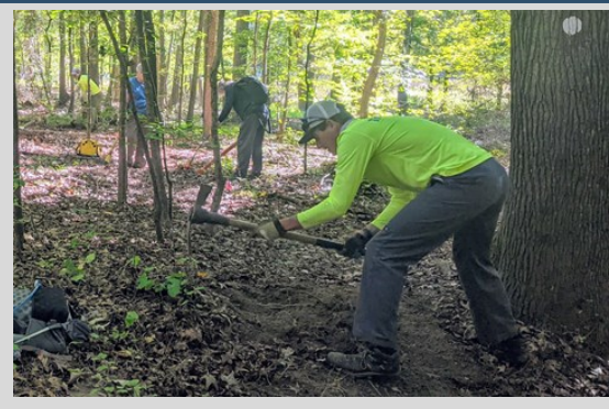
FMST volunteers hard at work constructing a new section of trail along Panther Creek at Falls Lake.

The Friends of the Mountains to Sea Trail (FMST) had 72 volunteers out to celebrate National Public Lands Day (NPLD). The volunteers split into two groups to tackle trail building and clearing at several sites along the 60 miles of trail that FMST maintains at Falls Lake. FMST and USACE collaborated in receiving a $1,000 NEEF grant to support this event.