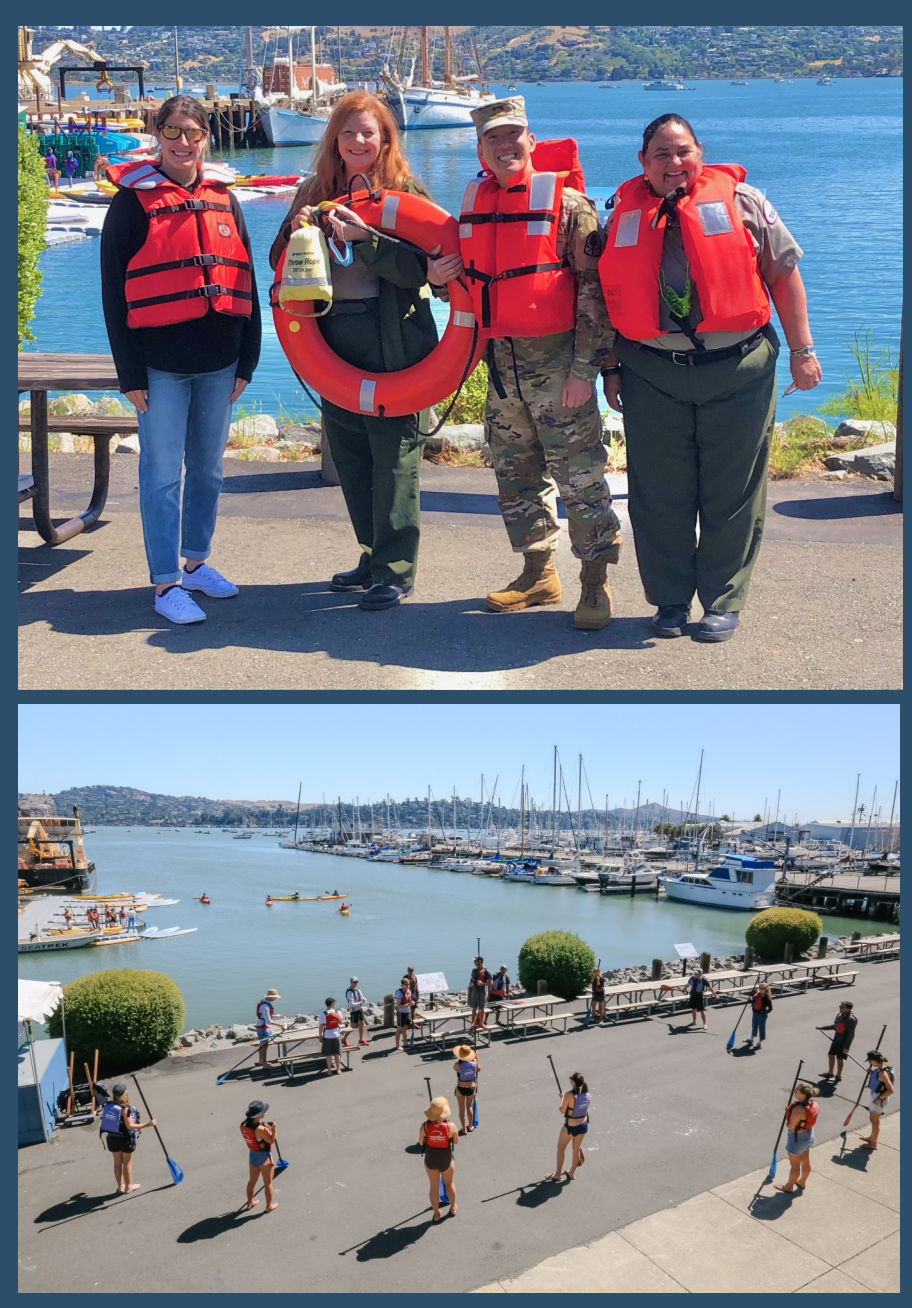
Photo Top: Wear a Life Jacket to Work Day. Photo Bottom: Sea Trek Paddling Demonstration

Call of the Sea is an educational nonprofit that connects people to the sea using its teaching platforms—the 82' schooner Seaward and the 132' Matthew Turner brigantine tall ship. Some of the most en-