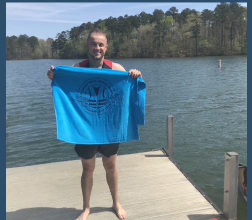
J. Strom Thurmond Lake