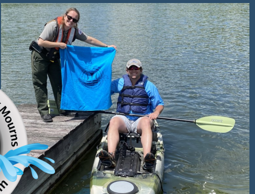
Nolin River Lake