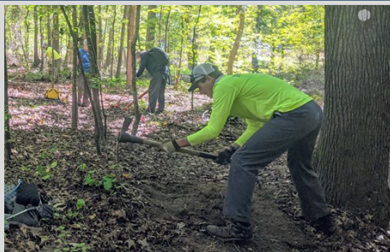
FMST volunteers hard at work constructing a new section of trail along Panther Creek at Falls Lake.

The Friends of the Mountains to Sea Trail (FMST) had 72 volunteers out to celebrate National Public Lands Day (NPLD) on Saturday, September 25th. The volunteers split into two groups to tackle trail building and clearing at several sites along the 60 miles of trail that FMST maintains at Falls Lake. FMST and USACE collaborated in receiving a $1,000 NEEF grant to support this event.