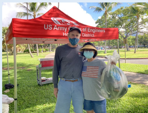
Groups received instructions and did their part in a successful cleanup event.