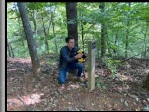
Above: Members of the NW NC MTB Alliance installing signs on Dark Mountain Trail system.