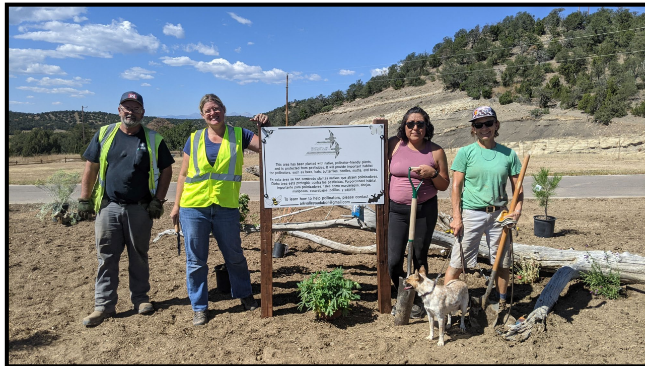
Volunteers and staff with the completed pollinator garden and interpretive sign.