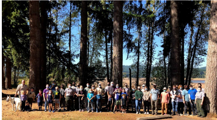
Group photo of the volunteers and Rangers who planted native trees and shrubs in Pine Meadows Campground.