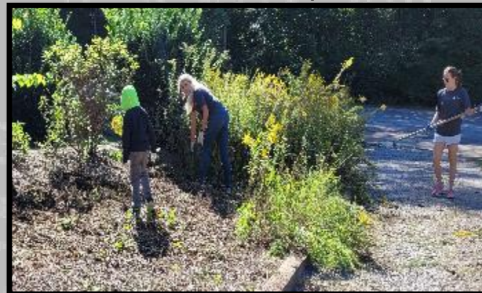
Bottom Left: Volunteers pulling invasive species and Golden Rod out of pollinator plots to make way for more diverse native plants.

Below: Volunteers spreading gravel on Fish Dam Creek Park's walking path.