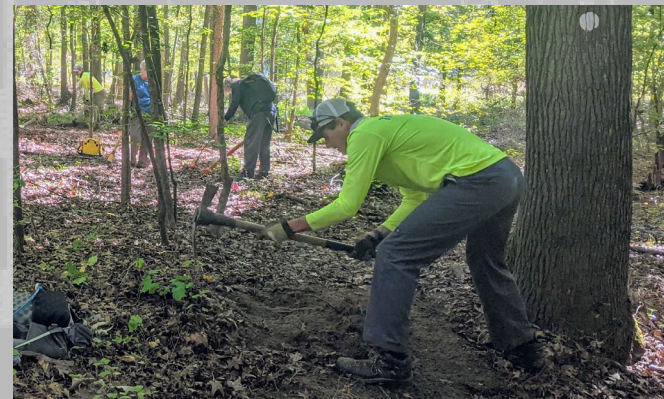
FMST volunteers hard at work constructing a new section of trail along Panther Creek at Falls Lake.

Working Today to Build a Better Tomorrow