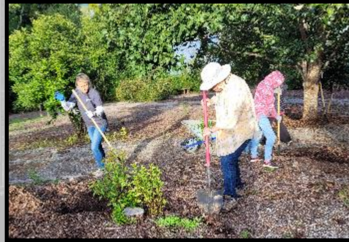
Top Left: Volunteers raking mulch and weeds for ground cover to be planted.