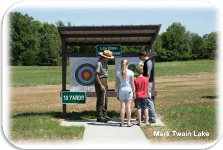
Mark Twain Lake