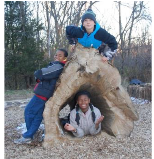
Red Rock Lake