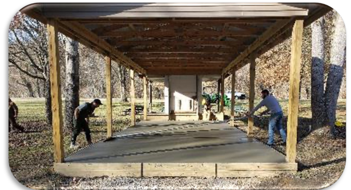
Barren River Lake