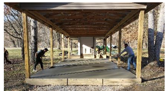
Barren River Lake