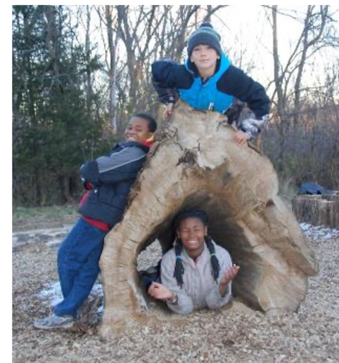
Red Rock Lake