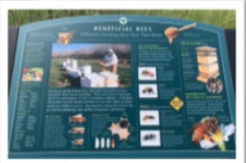
Carters Lake – Pollinator Project