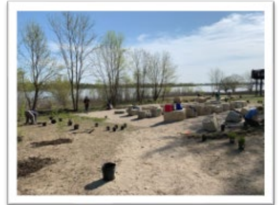
Rivers Project - Outdoor Amphitheater

Corps facilities offer many volunteer opportunities. Volunteers can serve as park and campground hosts, staff visitor centers, conduct programs, clean shorelines, restore fish and wildlife habitat, maintain park trails and facilities, and more. For more information on volunteering please contact your local Corps facility or visit www.volunteer.gov