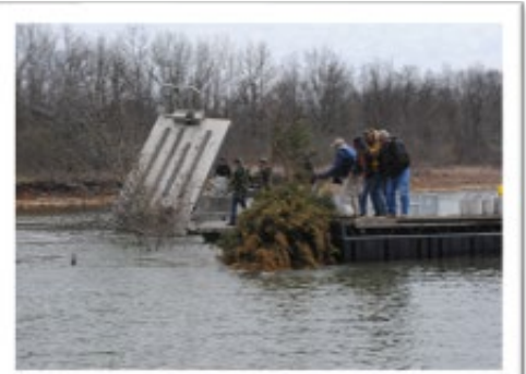
Smithville Lake – Habitat Enhancement