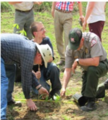
Carr Creek Lake – Chestnut Orchard