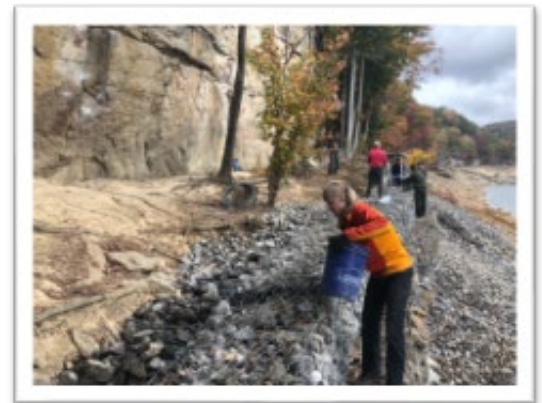
Summersville Lake - Climbing Trail