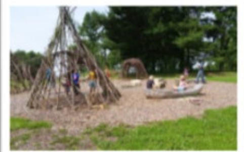
Red Rock Lake – Natural Playscape