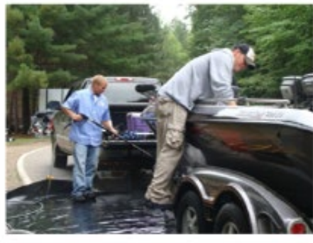
Gull Lake – Invasive Species Wash Station