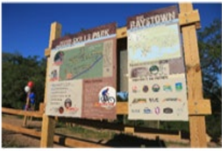
Raystown Lake – Bike Skills Park

Over the past twenty years, HQUSACE has made $3.6 million in “seed money” available through the Handshake Program.