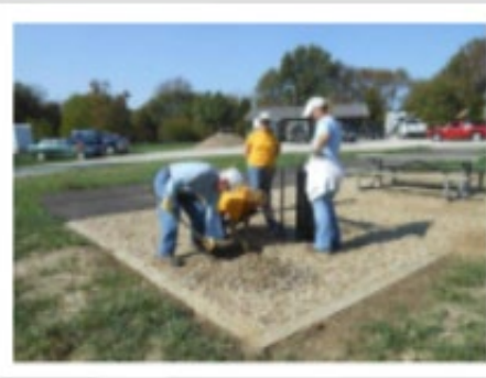
Mark Twain Lake – Equestrian Campground