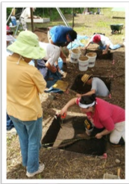
Kaw Lake – Archaeological Research

The Corps has formal partnership agreements with more than 40 national organizations, including American Chestnut Foundation, Boat US, CAST for Kids, Kids to Parks, Leave No Trace, International Mountain Biking Association, National Audubon Society, Ruffed Grouse Society, Union Sportsmen's Alliance, the YMCA and more! These partners have been vital in helping the Corps of Engineers meet our natural resources and recreation management goals. For a full list, visit