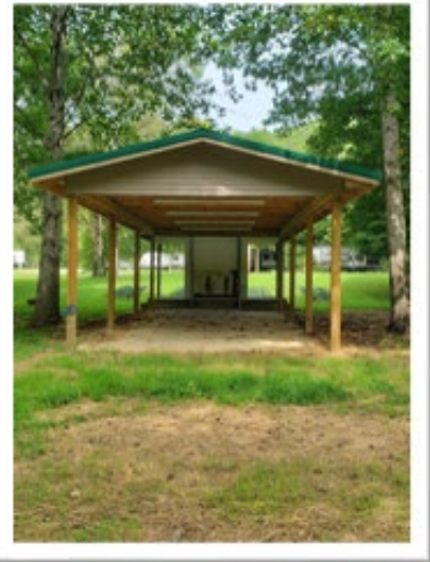
Barren River Lake - Pavilion