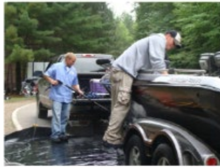
Gull Lake – Invasive Species Wash Station

Over the past seventeen years, HQUSACE has made $3.1 million in “seed money” available through the Handshake Program.