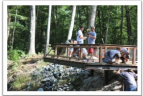
Lake Ouachita - ADA Fishing Pier

Corps facilities offer many volunteer opportunities. Volunteers can serve as park and campground hosts, staff visitor centers, conduct programs, clean shorelines, restore fish and wildlife habitat, maintain park trails and facilities, and more. For more information on volunteering please contact your local Corps facility or visit www.volunteer.gov