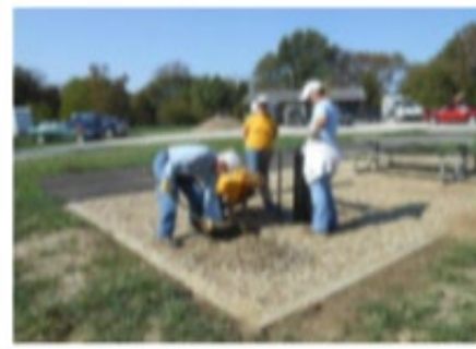
Mark Twain Lake – Equestrian Campground