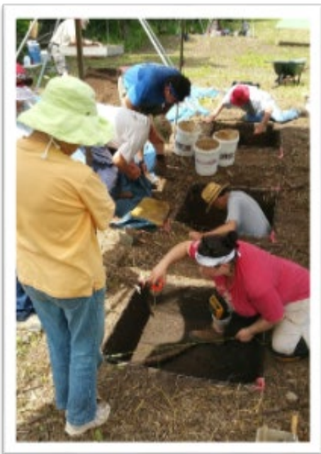
Kaw Lake – Archaeological Research

The Corps has formal partnership agreements with more than 40 national organizations, including American Chestnut Foundation, Boat US, CAST for Kids, Kids to Parks, Leave No Trace, International Mountain Biking Association, National Audubon Society, The Great Outdoors Fund, Union Sportsmen's Alliance and more! These partners have been vital in helping the Corps of Engineers meet our natural resources and recreation management goals. For a full list, visit