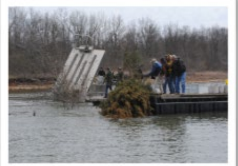
Smithville Lake – Habitat Enhancement