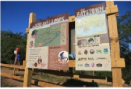
Raystown Lake – Bike Skills Park