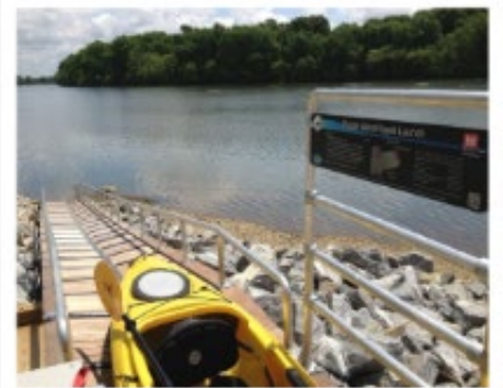
John H Kerr Lake – Kayak Launch