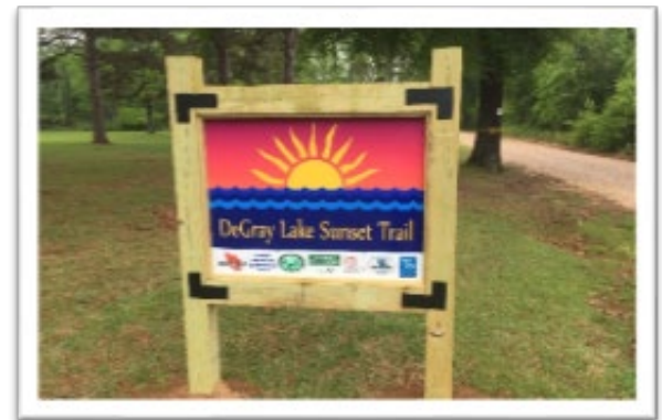
DeGray Lake - Interpretive Trail