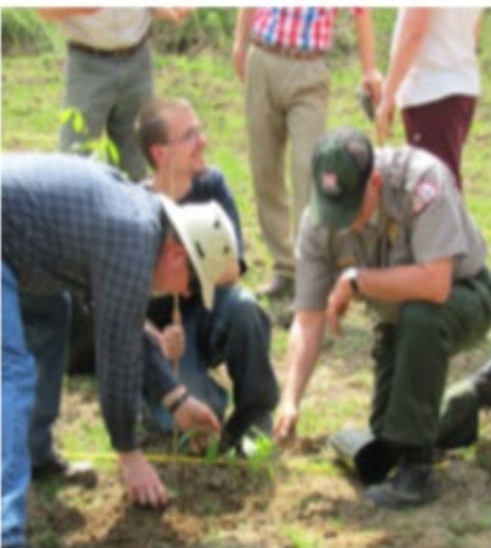
Carr Creek Lake – Chestnut Orchard