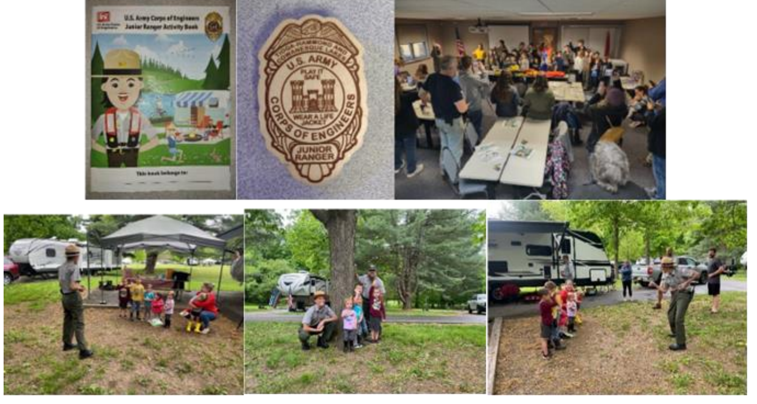
Successful Junior Ranger Program – Badge Swear In 2022 & 2023