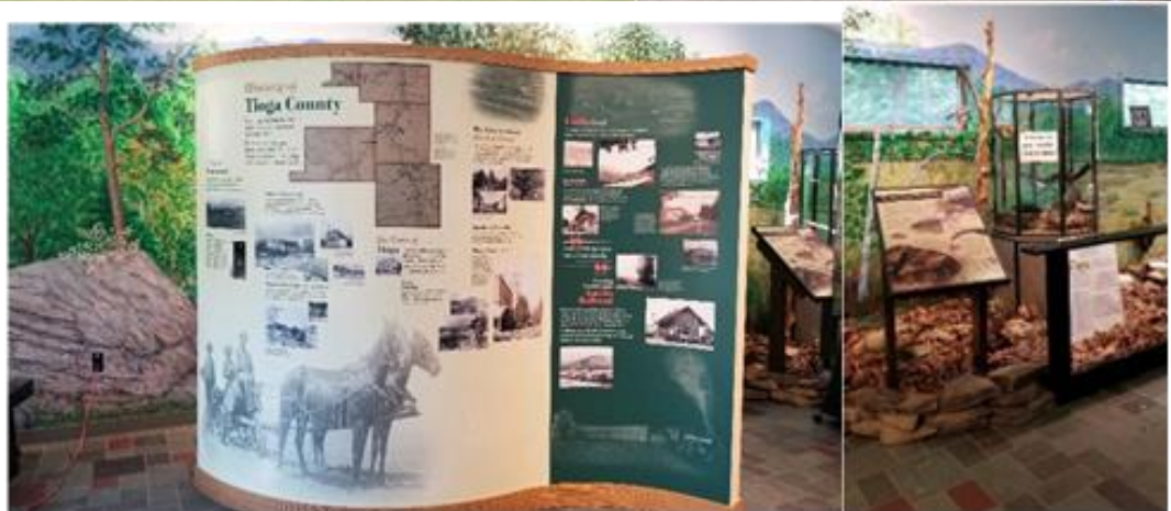
Ives Run Visitor Information Center, Exhibits, and Osprey Viewing Kiosk