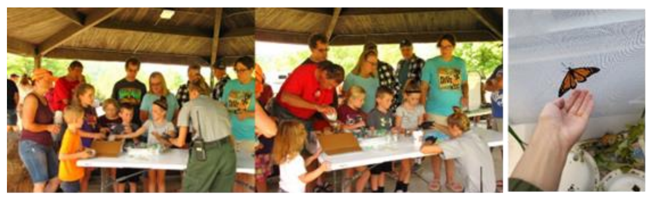
Pollinator & Milkweed Stratification Program 2022