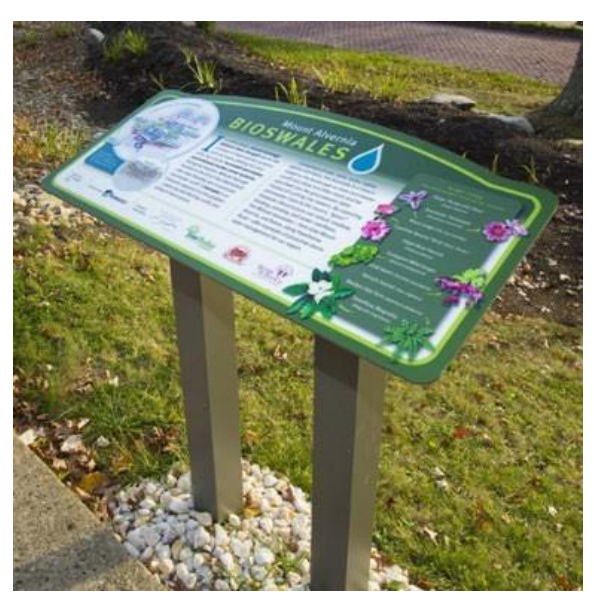
Interpretive Nature Trail Panel Design-Curved Fiberglass-Double Frameless