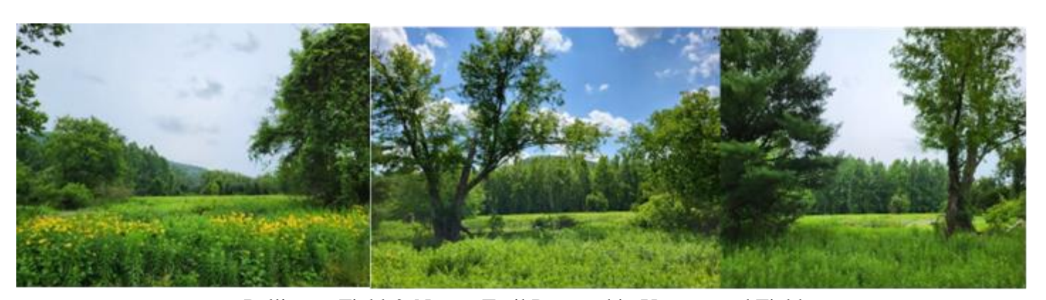
Pollinator Field & Nature Trail Partnership Unmanaged Field