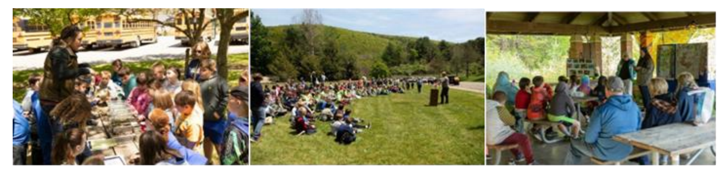
Every Kid in The Outdoors Event 2023