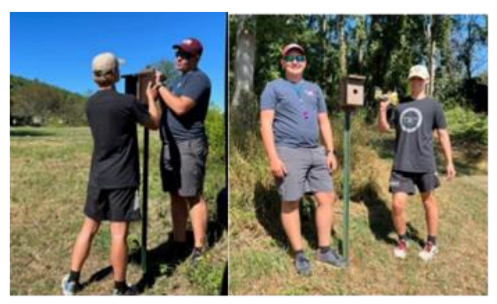
Bluebird Box Demonstration Program 2022