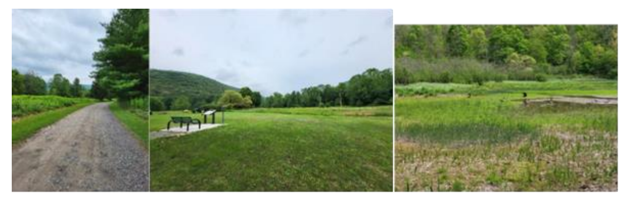
Railroad Grade Trail Entrance, Osprey Viewing Point, and Wetland