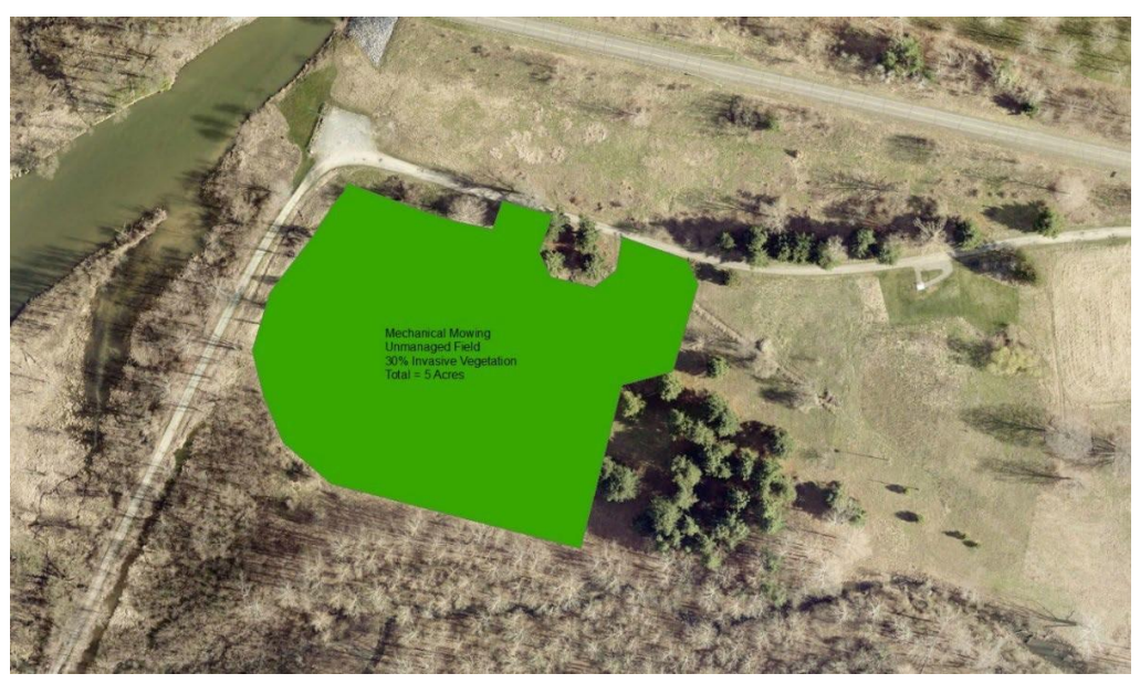
5 Acres Mechanical Mowing & Herbicide Spray Map Overview