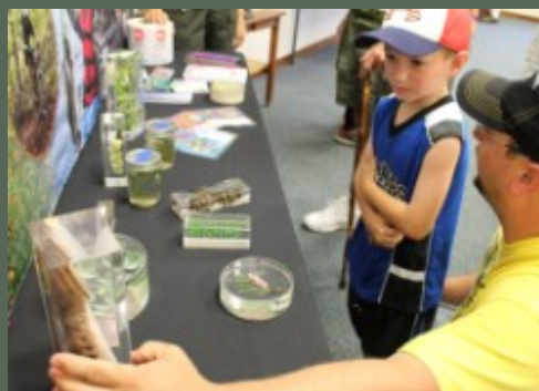
Above and right: The Invasive Species Leadership Team's Traveling Trunk.