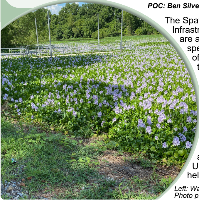
Left: Water hyacinth at the Willow Beach Camping Area. Article continued on page 2.

The purpose of this standard is to ensure consistency when surveying and mapping the locations of invasive and noninvasive nuisance species that create negative impacts at USACE projects. The NRM technical support team enlisted the help of Motivf, a contractor, to field test the standard.