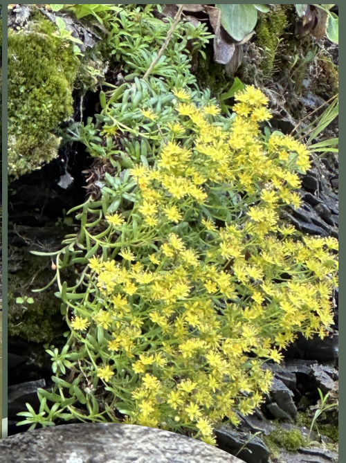
Left to right: Ranger Jerome points to yellow mountain –saxifrage; Ranger Smith looks for special status species as part of the riparian area survey; Plant species yellow mountain-saxifrage. Circle: Butterwort plant.