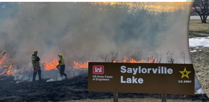
Above and right: Park Rangers at Saylorville Lake are hard at work completing projects such as tree work and prescribed burns.