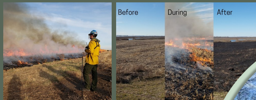
Above: The use of prescribed fire at the Rivers Project Office on USACE managed lands.