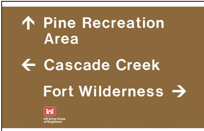
Directional Signs with Three Symbols