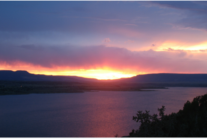
These parks offers some of the finest fishing in northern New Mexico. Reptile fossils 200 million years old have been found in many areas. The state has some of the most beautiful panoramic views in the area. Come visit today!