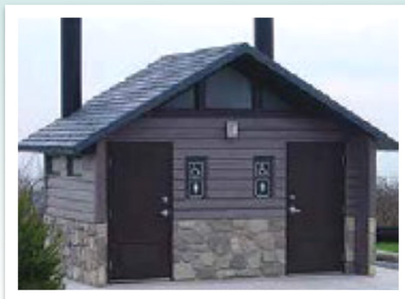
Pine Bluff trailhead restroom design