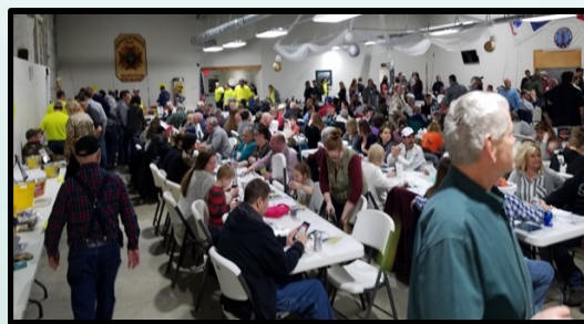
A large crowd of 290 enjoying the first annual Lake Shelbyville Fish Habitat Banquet in February 2019 raising over $20,000.