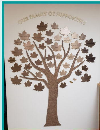
Donor wall in the Environmental Education Center