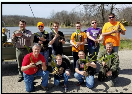
Local students prepare to transplant aquatic plants raised in the nursery maintained by the LSFHA.