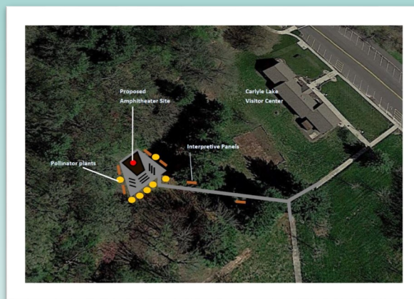
Carlyle Lake proposed outdoor classroom

For more information regarding the Handshake Program, please visit the Handshake page on the NRM Gateway or contact your division Partnership Advisory Committee member.