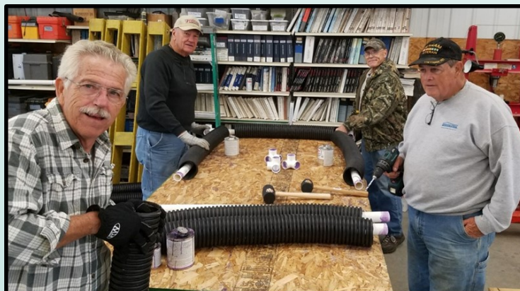
LSFHA members assemble Shelbyville Cubes to be placed in the lake for improved fish habitat.

greatly to the success of USACE in meeting its environmental stewardship and recreation objectives as well as contributing to the quality of the fishery for the surrounding community to enjoy. See more photos on page 8.