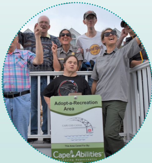
Cape Abilities partners with the Cape Cod Canal (NAE) for litter pick up.