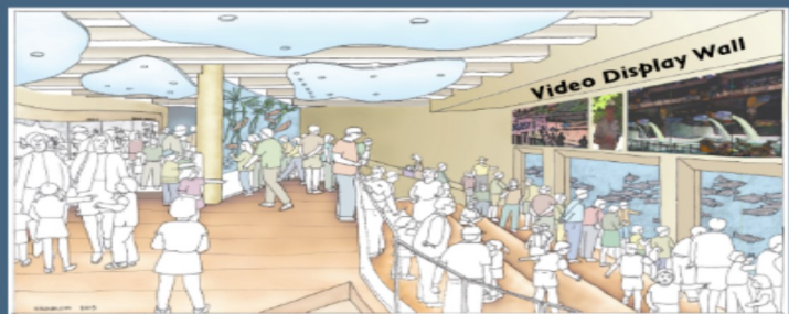
Phase I (Starting Winter 2017-18)