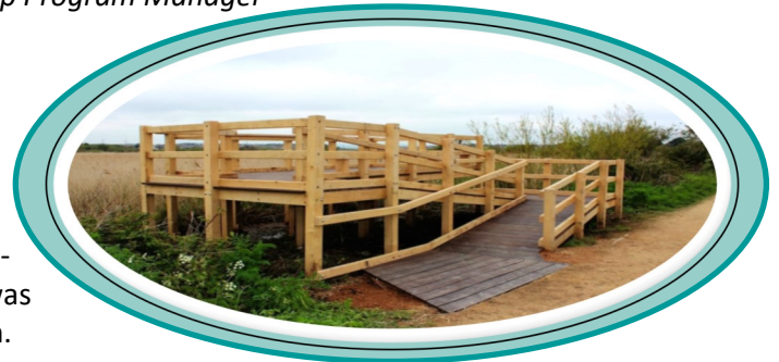
Proposed wildlife viewing platform: Rend Lake

The Handshake Program is an incentive program developed by HQUSACE for field sites to develop partnerships and use partnership authorities to encourage community engagement. For FY 19, there was $100,000 available for competition.