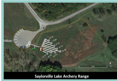
Saylorville Lake Archery Range