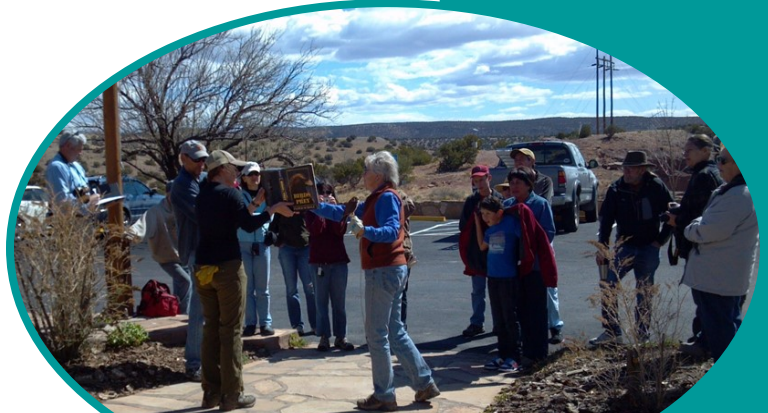
New Mexico Wildlife Center provides the public with Kestrel Education program

such as these, the Wildlife Center brings several captive animals to showcase to the public, offering a unique interpretive experience. The New Mexico Wildlife Center also assists USACE with their bald eagle survey, and brings out their captive bald eagle, Maxwell, to assist the public in identifying eagles from far distances. The partnership between Abiquiu Lake and New Mexico Wildlife Center has been very rewarding for all parties involved, and will continue to grow and expand in the future.