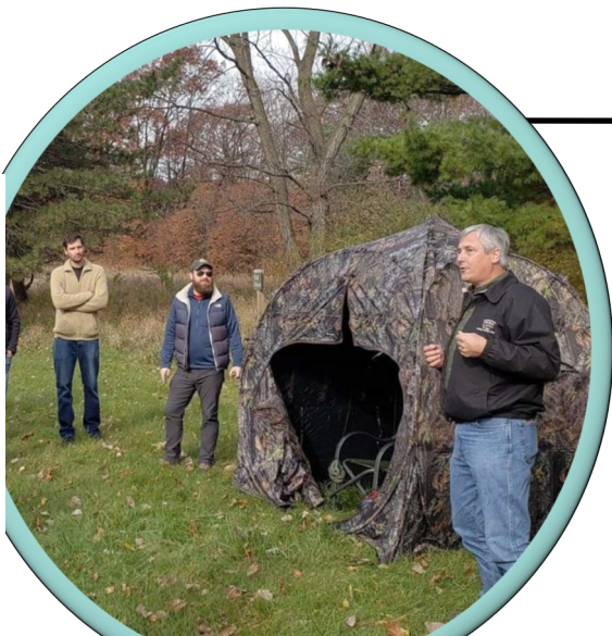
Lake Washington Ship Canal proposed salmon viewing area upgrades