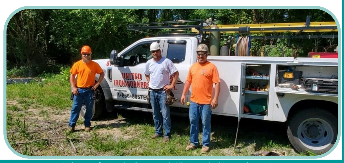
Volunteers from Union Sportsmen's Alliance United Ironworkers Union