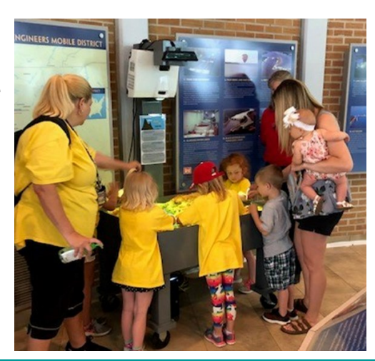
A family tries out the AR sandbox in the Carters Lake Visitor Assistance Center.

this project. The only real limit is how far out you're willing to reach for a new and meaningful interpretive experience.