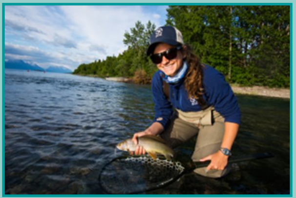
SCA intern conducting fish surveys

USACE has entered into a new master national cooperative agreement with SCA under the authority of Sec 213(a) of WRDA 2000. This authority allows USACE to