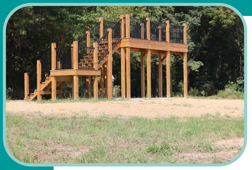
Elevated archery shooting platform

tournament award ceremonies, and announcement broadcasting. Handshake funds received will upgrade the electric service. This work is scheduled to happen in early 2021. These upgrades will fulfill the requirements of the event contracts to improve tourism opportunities and economic benefits to the Rend Lake area.