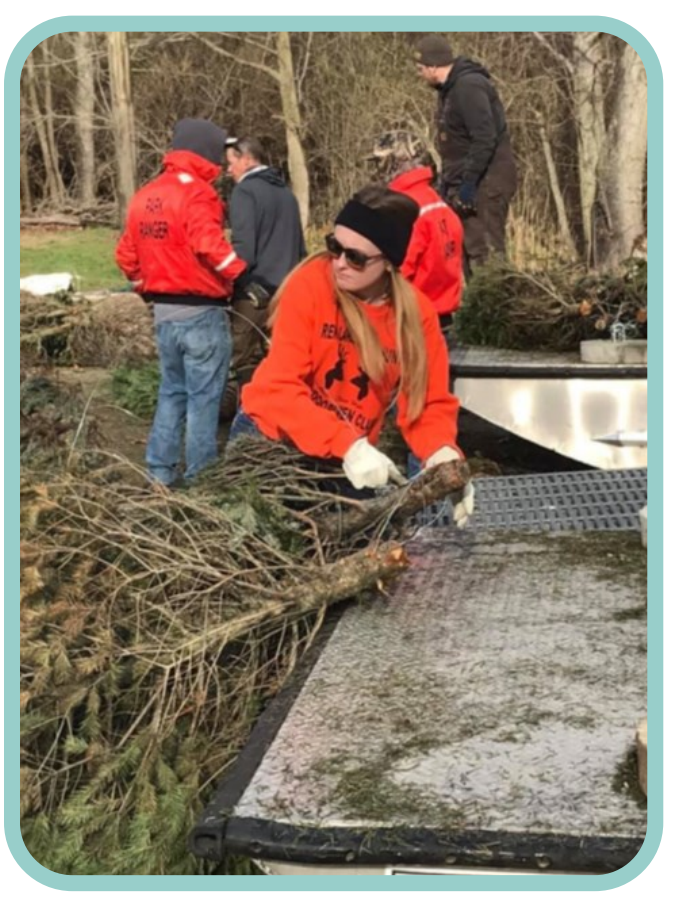
SVOC member assisting in a Christmas tree habitat project

The Excellence in Partnerships Award, sponsored by the Corps Foundation, annually recognizes exceptional contributions by a partner providing substantial support to the USACE Recreation and Environmental Stewardship programs.