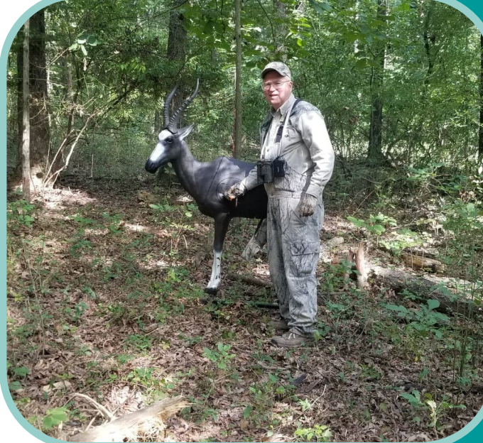
Archery animal target

This improvement project has been enjoyed by the public, brought new visitors to Rend Lake, and prompted several regional and national organizations to request the use of this area for future large events. There is ample parking within the day use area, but there is currently no electricity to support food vendors,