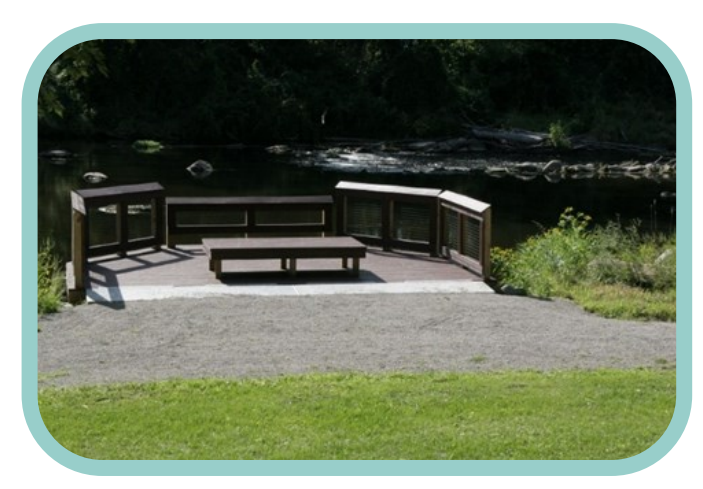
Berlin Lake fishing platform example