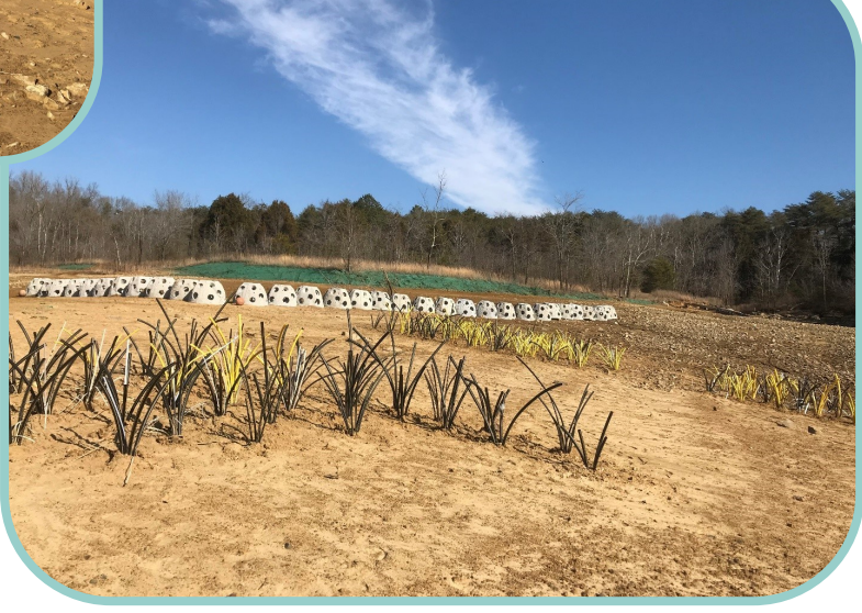
Site 2 of the Nolin River Lake Bank stabilization project showing pre and post-installation of reef balls, hydroseeded native grasses and wildflowers, and artificial fish attractors

The grant awarded through RFHP included $30,000 for patented fiberglass reef ball molds, supply kits, and training from Reef Innovations to make the reef balls. While the reef balls are primarily for