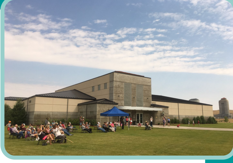
Viewing the solar eclipse in front of the Fort Peck Interpretive Center

How do we offer interpretive programs that allow visitors to see, smell and hold the public resources in our charge? Partnerships! Montana Fish, Wildlife and Parks (MFWP), USACE and volunteers teach kayak