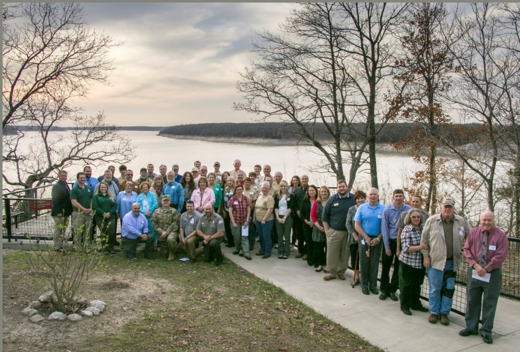
FOREST Council Mark Twain Lake 2017 EIP Winner

"The views, opinions and findings contained in this report are those of the authors(s) and should not be construed as an official Department of the Army position, policy or decision, unless so designated by other official documentation."