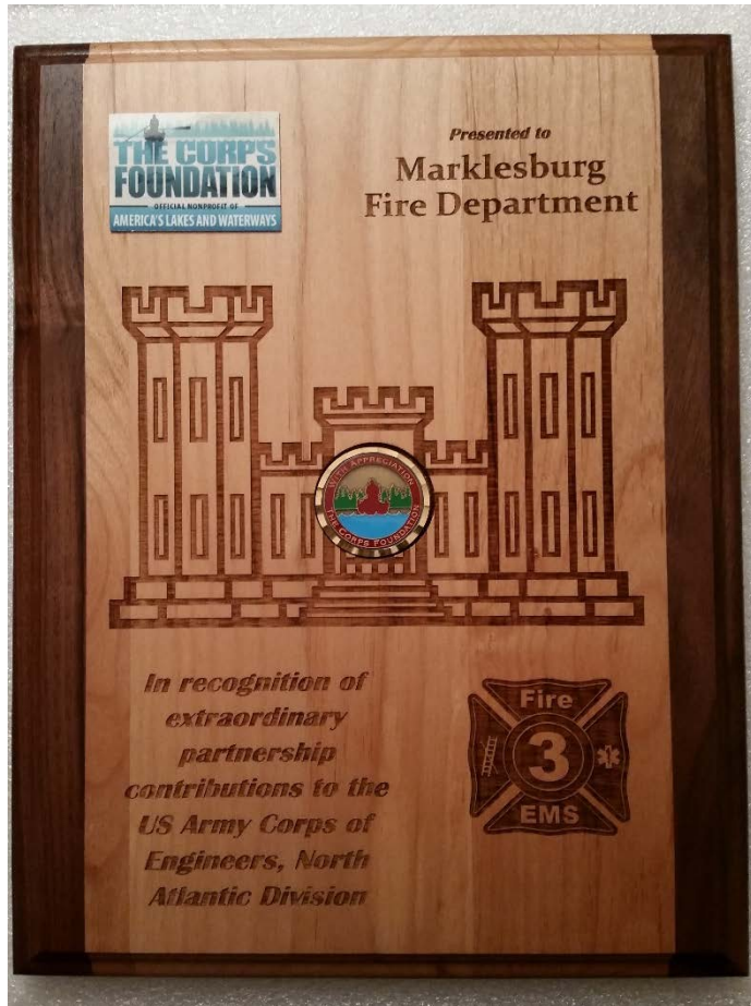
Plaque and ceremony for overall winner, provided by the Corps Foundation