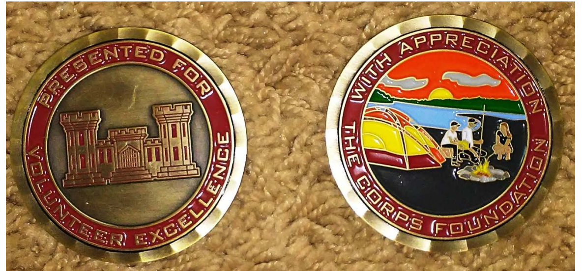
Corps Foundation Volunteer Excellence Coin and certificate for each regional nominee as well as the overall winner