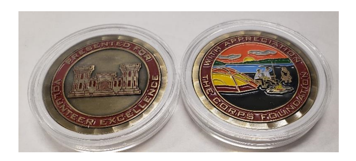
Corps Foundation Volunteer Excellence Coin and certificate for each regional winner (each division's nomination)