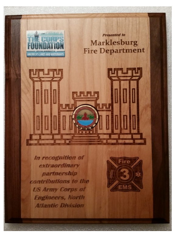
Plaque and ceremony for overall winner, provided by the Corps Foundation