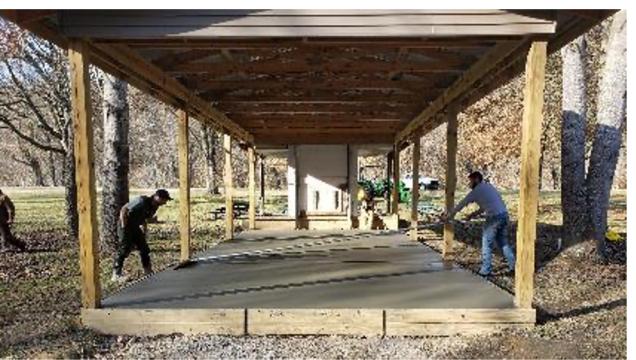
Barren River Lake