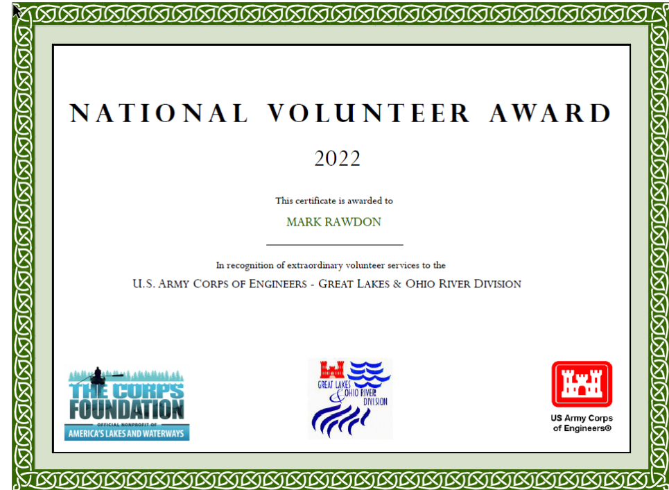
Corps Foundation Volunteer Excellence Coin and certificate for each regional nominee as well as the overall winner