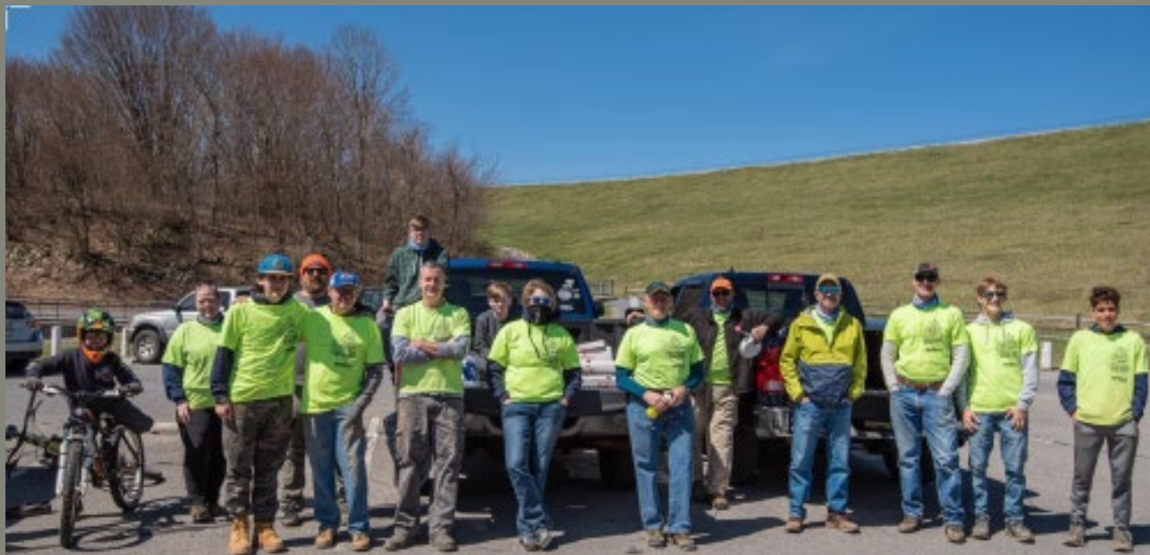
Berks Area Mountain Bike Club -Blue Marsh Lake 2021 EiP Winner

“The views, opinions and findings contained in this report are those of the authors(s) and should not be construed as an official Department of the Army position, policy or decision, unless so designated by other official documentation.”