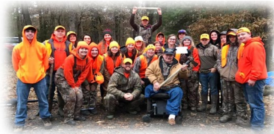
SVOC members and hunters during the Annual Rend Lake Deer Hunt for Individuals with Disabilities.