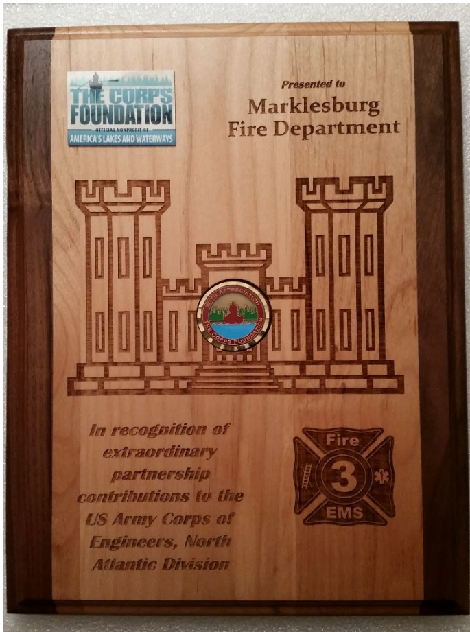
Plaque and ceremony for overall winner, provided by the Corps Foundation