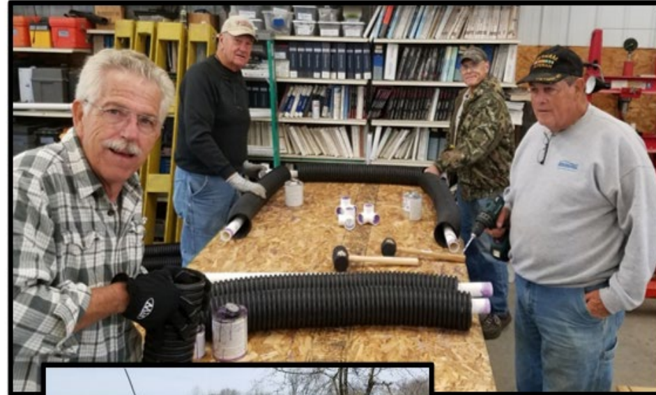
LSFHA members assemble Lake Shelbyville Cubes to be placed in the lake for improved fish habitat.