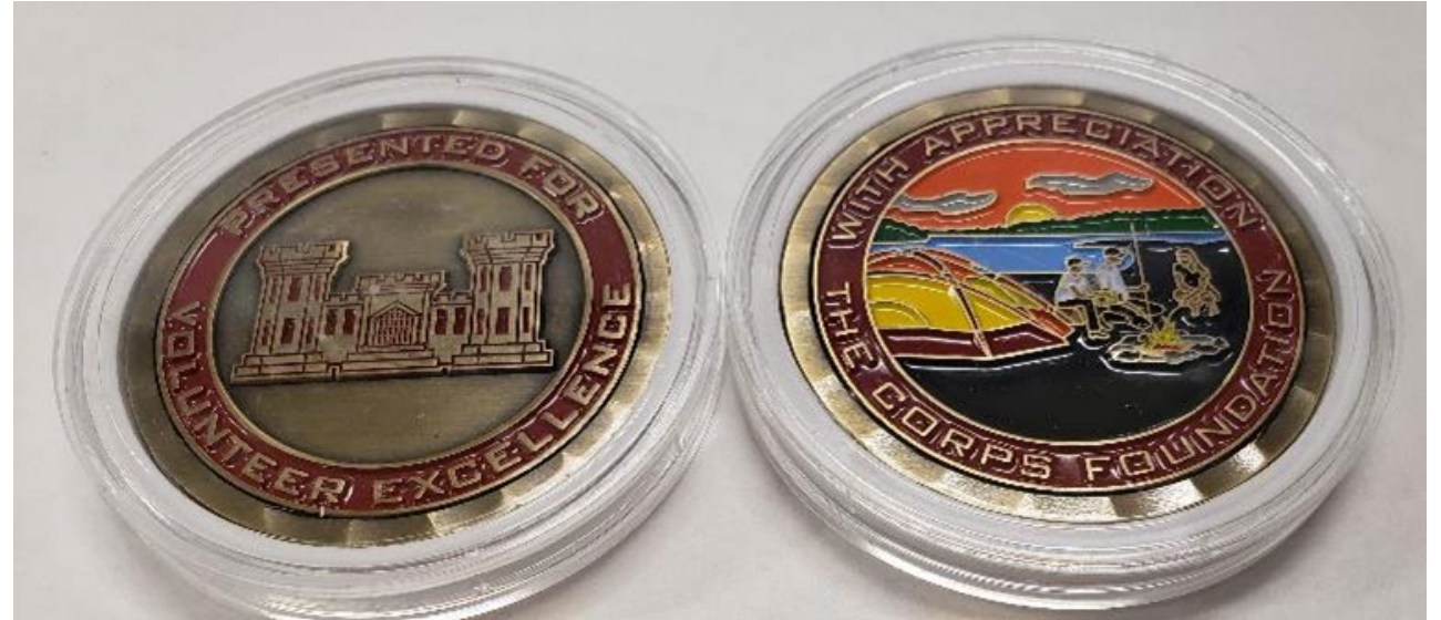
Corps Foundation Volunteer Excellence Coin and certificate for each regional winner (each division's nomination)