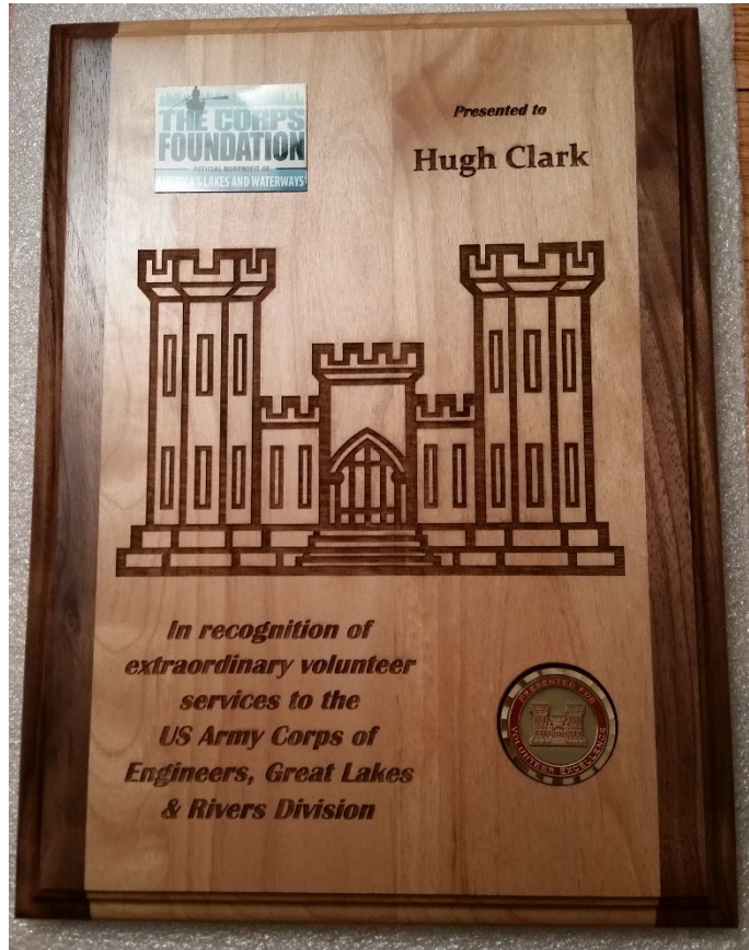
Plaque and ceremony for overall winner, provided by the Corps Foundation