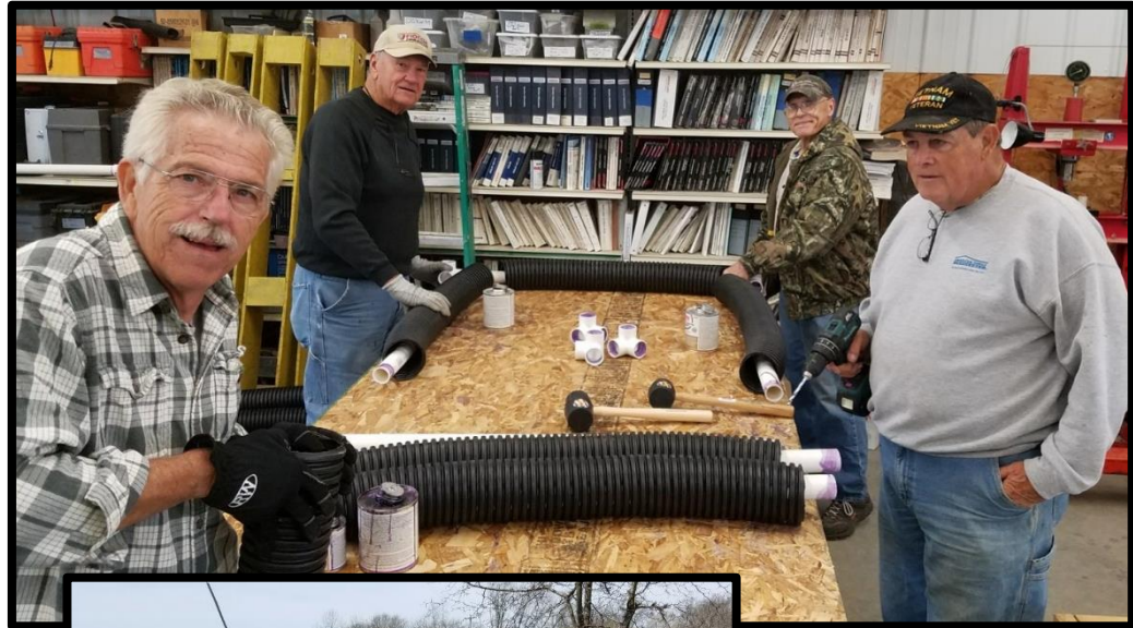
LSFHA members assemble Lake Shelbyville Cubes to be placed in the lake for improved fish habitat.