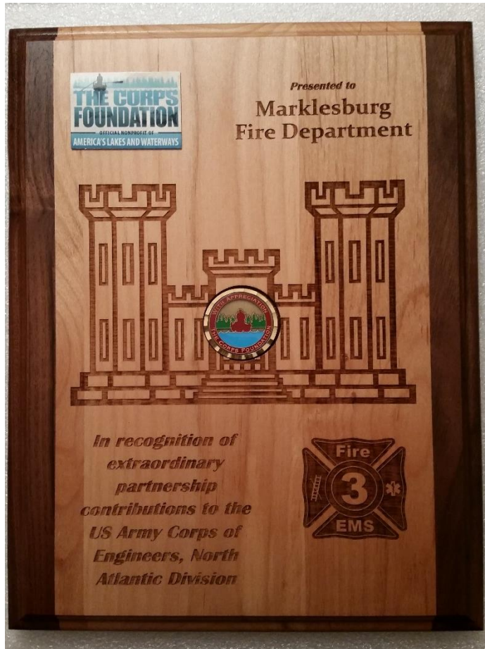
Plaque and ceremony for overall winner, provided by the Corps Foundation