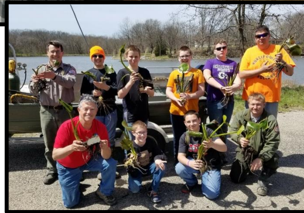
Local students prepare to transplant aquatic plants raised in the nursery maintained by the LSFHA.