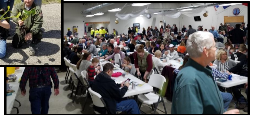
A large crowd of 290 enjoying the first annual Lake Shelbyville Fish Habitat Banquet in February 2019 raising over $20,000.