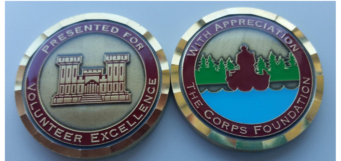
Corps Foundation Volunteer Excellence Coin and certificate for each regional nominee as well as the overall winner