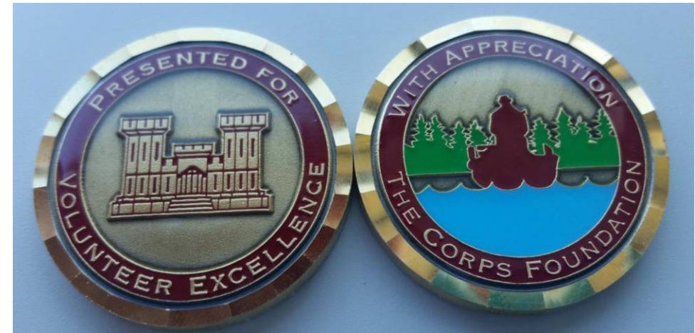
Corps Foundation Volunteer Excellence Coin and certificate for each regional winner (each division's nomination)