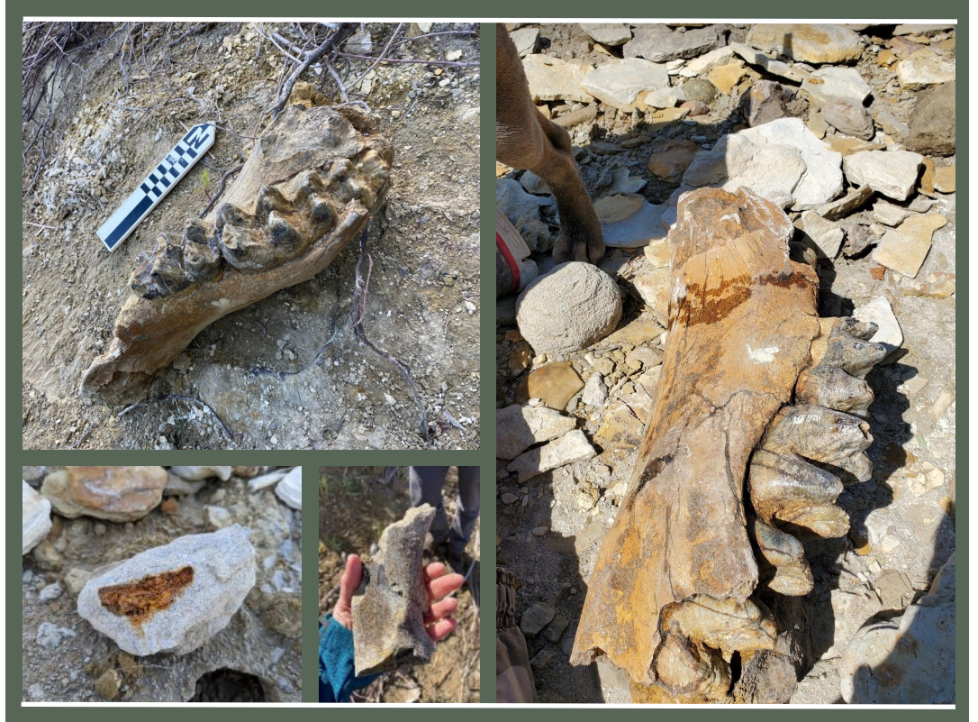
Photos (Clockwise beginning in upper left): Mastodon jawbone with scale, mastodon jawbone, scapula, petrified wood.

A mastodon jawbone was found on Apr. 14, 2022 by a member of the public while walking Corps lands on the Columbia River near Pasco, WA. The man notified USACE staff so that preservation could occur. With the help from experts at the Wanapum Heritage Center in Tri-Cities, the Walla Walla District Cultural Team and Tri-Rivers NRM staff were able to properly account for this piece of history. While surveying the site the cultural team also discovered petrified wood and a scapula, most likely from a large mammal such as an elk or bison, that lived in the area thousands of years ago. Fossils such as these are documented and protected by law. The long-term plan for the mastodon jawbone is to make it available for public viewing at the Walla Walla District Visitors Center.