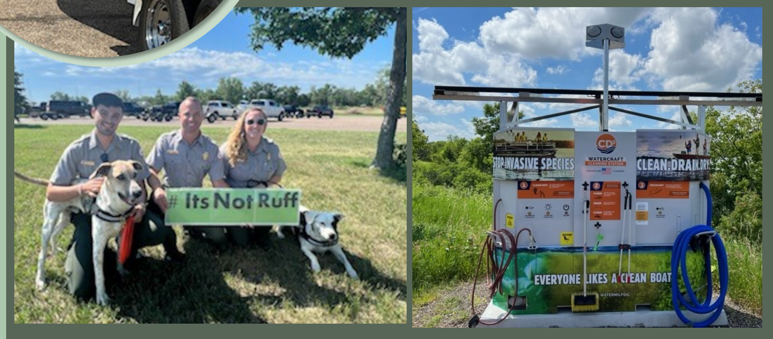
Photos: Garrison Project staff with K-9 demonstrations and aquatic nuisance species control efforts.

simultaneously. It was a successful weekend with no mussels detected! In addition to the K-9 demonstration, Garrison Project staff have begun to execute other education and prevention strategies such as Awareness Wednesday social media campaign, recruiting the USFWS Dive Inspection Team, and hiring Recreation Area ANS Inspectors in partnership with the State. The Garrison Project staff plans to continue expanding upon their current prevention efforts and hopes to implement K-9s more in the future.