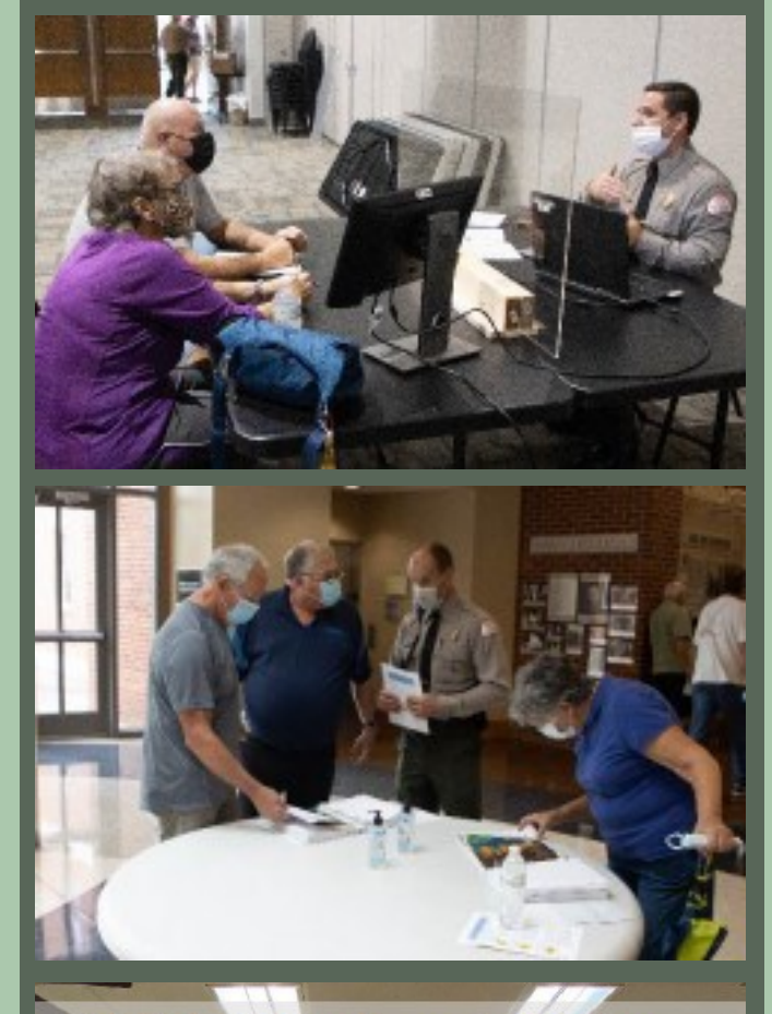
PDT Mapping Team Meeting